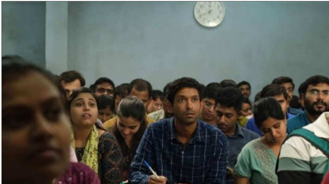
A still from the hit Bollywood movie 12th fail, based on a true story of a UPSC aspirant's journey to success

We should leave the over obsession with UPSC. There are innumerable ways though which we can do a lot for society and for ourselves. There are numerous avenues where individuals can make a