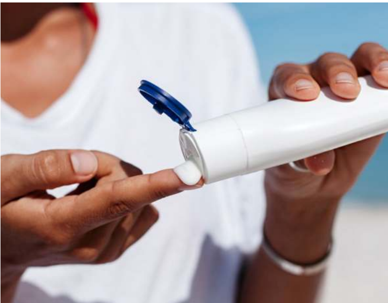
min D levels.

Many studies have investigated the effect of sunscreen use on vita-