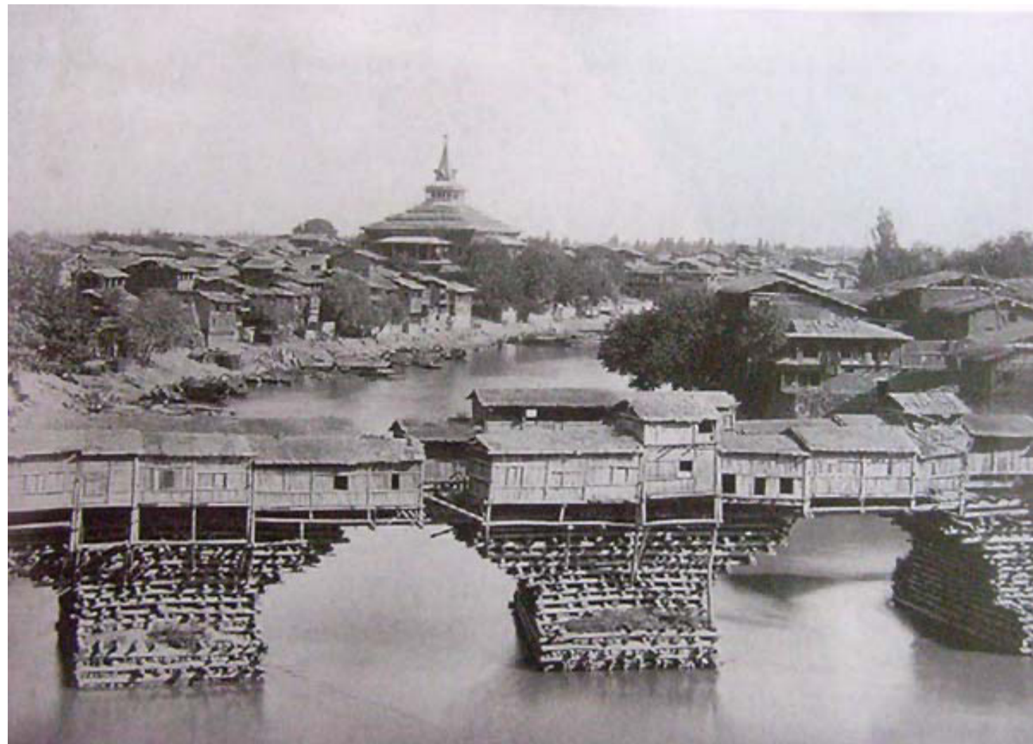
Downtown, Srinagar.

Earthquakes of 1864 and 1885 and their aftershocks gave sleepless nights to Kashmiris for months together. Though the population of the valley was very thin then, still the shocks took a heavy toll of life. During the earthquake of 1885, Baramulla and Pattan areas were badly affected.