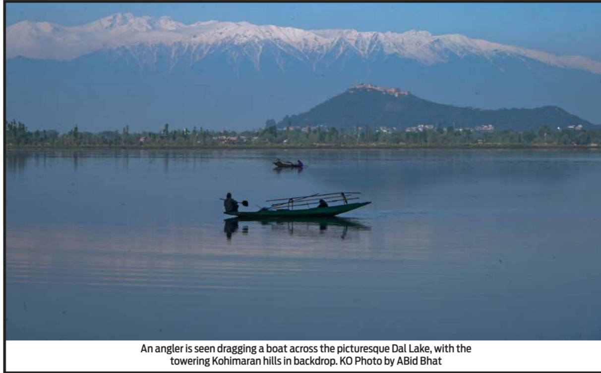
An angler is seen dragging a boat across the picturesque Dal Lake, with the towering Kohimaran hills in backdrop.