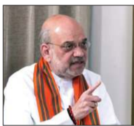
Shah stated this while interacting with the BJP delegation at The Lalit

Srinagar: Expressing 'regrets' of sorts for not contesting on three crucial Kashmir Lok Sabha seats, Union Home Minister Amit Shah Thursday said that the BJP unit of J&K must gear up to contest on all seats in the upcoming Assembly elections slated for September this year.