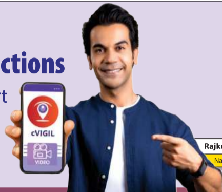
Rajkumar Rao National Icon, ECI

Play Your Part in Free & Fair Elections Scan & download the cVigil App to report any Model Code of Conduct violations