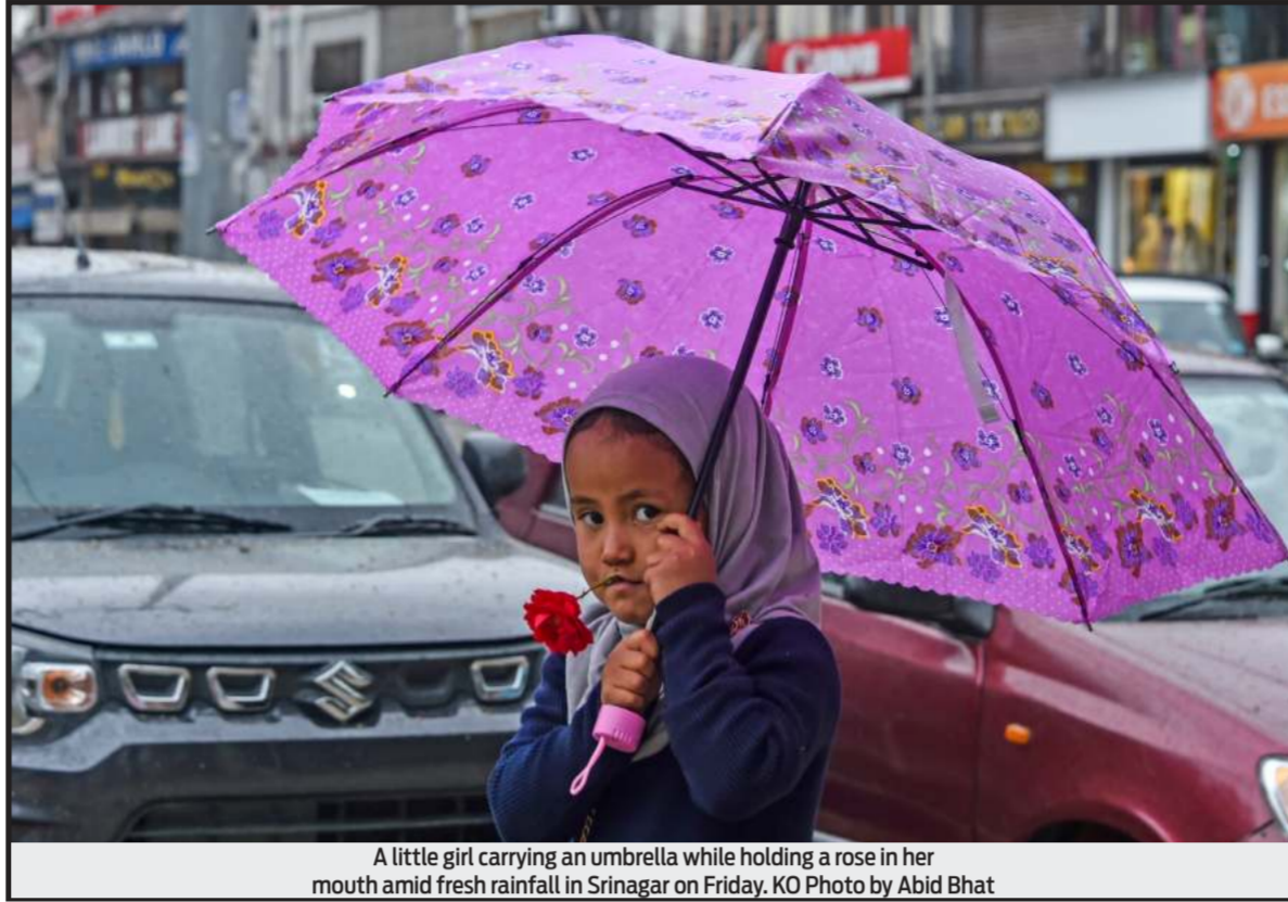
A little girl carrying an umbrella while holding a rose in her mouth amid fresh rainfall in Srinagar on Friday.

The DEO also stressed on a proactive approach by the Officers under close supervision of concerned AROs to preserve the sanctity of democratic institutions and ensuring free and fair polling at all polling stations.