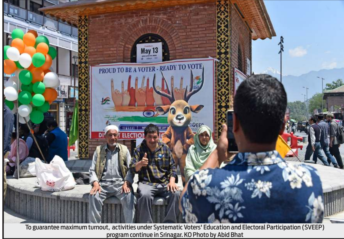
To guarantee maximum turnout, activities under Systematic Voters' Education and Electoral Participation (SVEEP) program continue in Srinagar.

The awareness program was well-received by the students, who showed keen interest in understanding their rights and responsibilities as citizens.