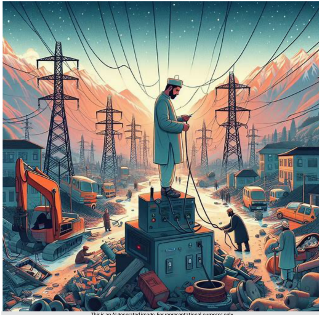
This is an AI generated image. For representational purposes only

The power crisis in Kashmir has reached alarming levels in recent times with the valley facing the worst ever electricity shortage this spring. The hopes of the residents are dimmed by the shadow of power crises plaguing the region. The Kashmir Power Distribution Corporation Limited (KPDCL) finds itself embroiled in a storm of discontent as consumers cry on broken promises and the perpetual darkness.