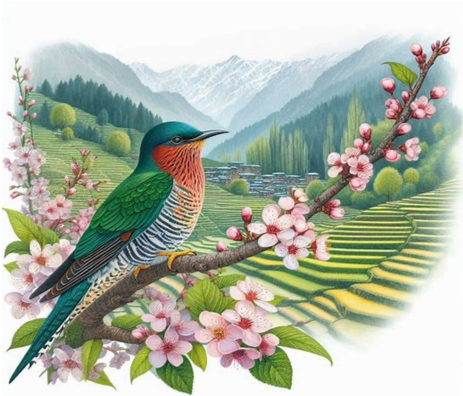
This is an AI generated illustration

Since our rural economy is chiefly sustained by agriculture and its allied sectors, the preparation of different seed-beds begins in the late March, but some of our progressive farmers and growers brave all odds of the harsh winter to incept the great work in the poly houses, during