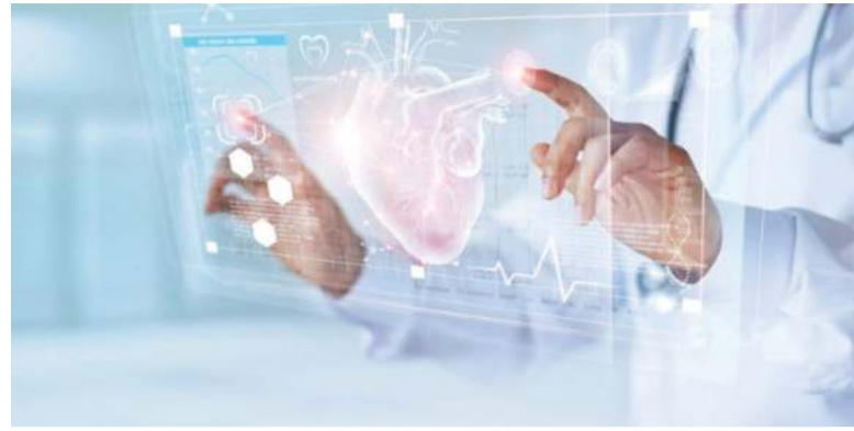
data to make predictions.

For developing the model, the team trained it on 24 hour-long recordings gathered from 350 patients at Tongji Hospital in Wuhan, China. The model, that the researchers have named WARN (Warning of Atrial fibrillation), is based on deep-learning, a type of machine-learning AI algorithms that learn patterns from past