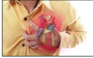
Further, the generative AI system also failed to match the traditional methods physicians use to judge a patient's cardiac risk.