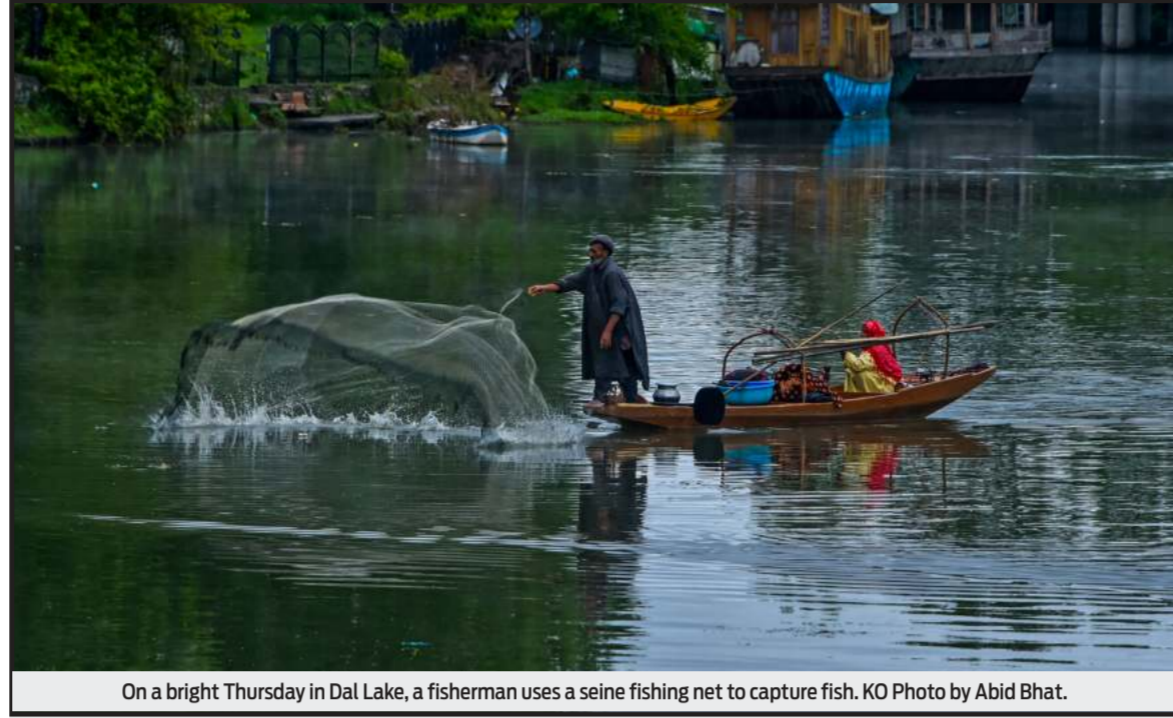
On a bright Thursday in Dal Lake, a fisherman uses a seine fishing net to capture fish.

Pertinently, J&K parts received fresh snowfall and rains for the three consecutive days from April 27-April 29, leading to the flood like situation in many areas as the water level increased rapidly, prompting the government to take several preventive measures including the closure of schools across the Valley as well—(KNO)