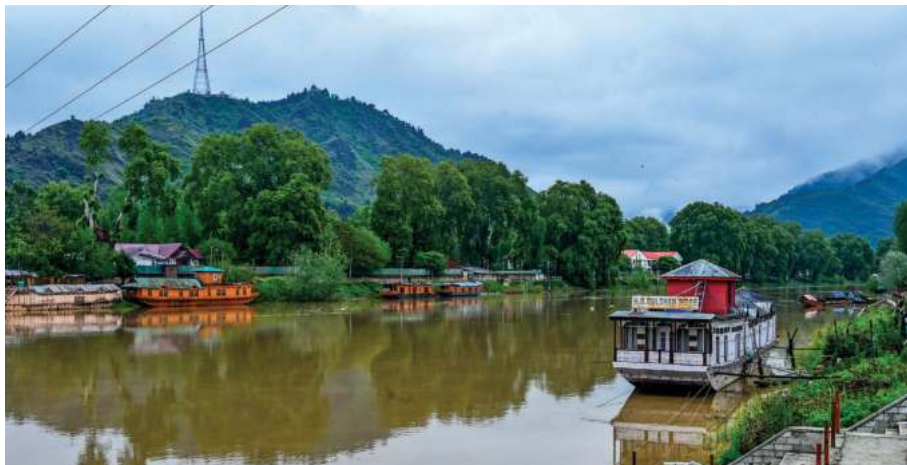
Meanwhile, the water level in river Jhelum late at night also crossed the flood

The officials said the water level at downstream locations along the river kept rising for a few hours and crossed the flood declaration mark at Pampore in Pulwama and Ram Munshi Bagh in Srinagar early Tuesday. But it has started to recede.