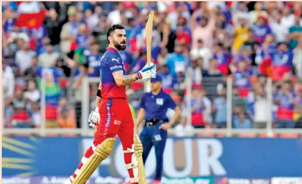
Narine on 184.02.

Despite accumulating 500 runs for the seventh time in an IPL season, Kohli's strike rate of 147.49 has come in for scrutiny ahead of the T20 World Cup in the U.S. and West Indies. Australia's Travis Head has the highest strike rate among the top 10 batsmen in the IPL scoring charts with 211.25 after eight games, ahead of West Indian Sunil