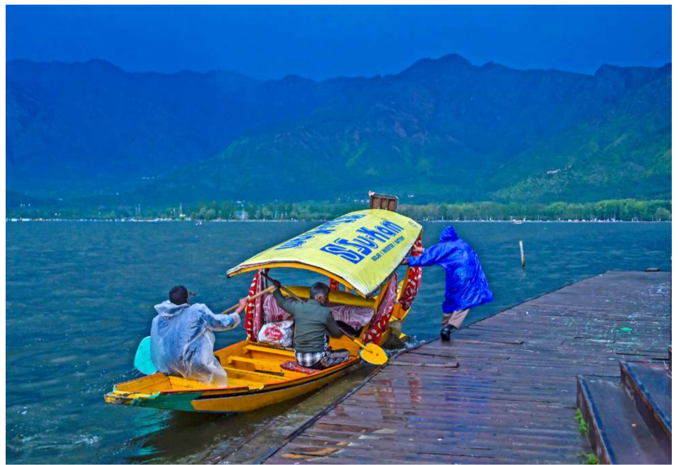
A MAN ROWS HIS SHIKARA BOAT on Dal lake amid heavy rainfall in Srinagar.

In Pulwama, 21 militants were killed in 2019, 19 in 2020, 17 in 2021, 24 in 2022, and 1 in 2023. Since 2019, a total of 82 militants have been killed in Pulwama, 68 in Anantnag, and 88 in Awantipora. A total of 60 militants have been arrested in Awantipora, 7 in Anantnag, while 58 youths joined militancy in Awantipora and 8 in Anantnag, the data reveals—(KNO)