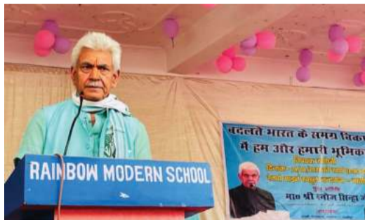
at Devkali, Ghazipur.

Uttar Pradesh: India is on the path to become Vishwa Guru and the cultural awakening today is inspiring one and all to serve humanity with dedication and devotion, Lieutenant Governor Manoj Sinha said on Wednesday. The LG was speaking at a symposium on cultural heritage, values and principles of Sanatan Dharma. The event was organized by Utthan Foundation Trust