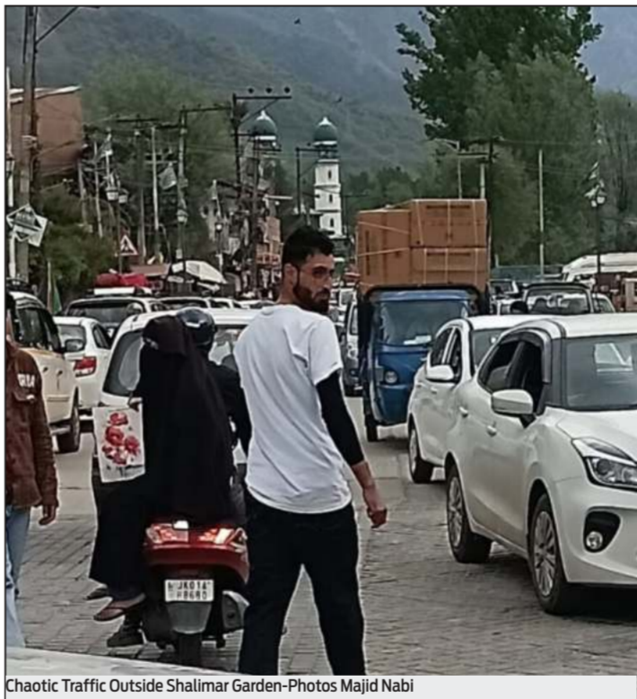
Chaotic Traffic Outside Shalimar Garden

When KO informed him that the area between Shalimar and Foreshore Road was ideal for a designated parking space, Malhotra said if the LCMA grants them land anywhere nearby, they might also establish a parking area like that in Nishat.