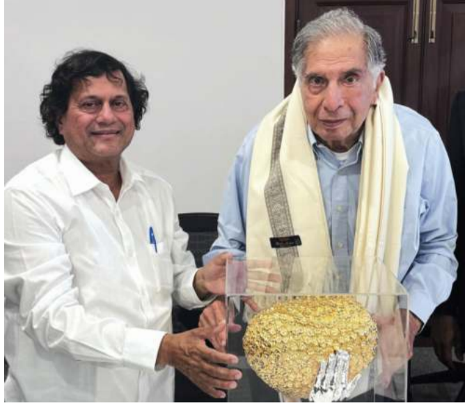
his home. Ratan Tata, usually reticent about accepting accolades, agreed to accept this award