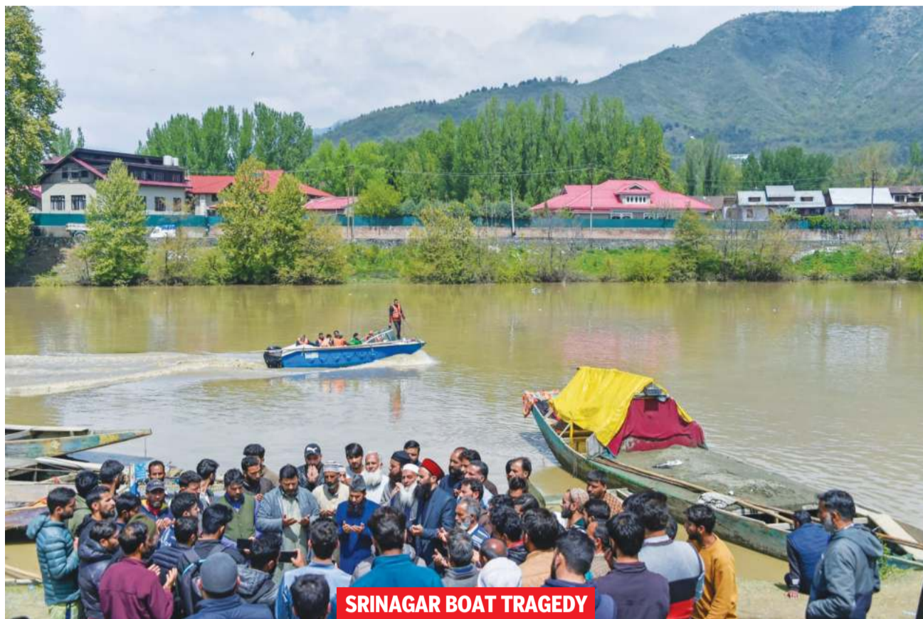
SRINAGAR BOAT TRAGEDY

Ganderbal district emerged as the front runner | More on P6