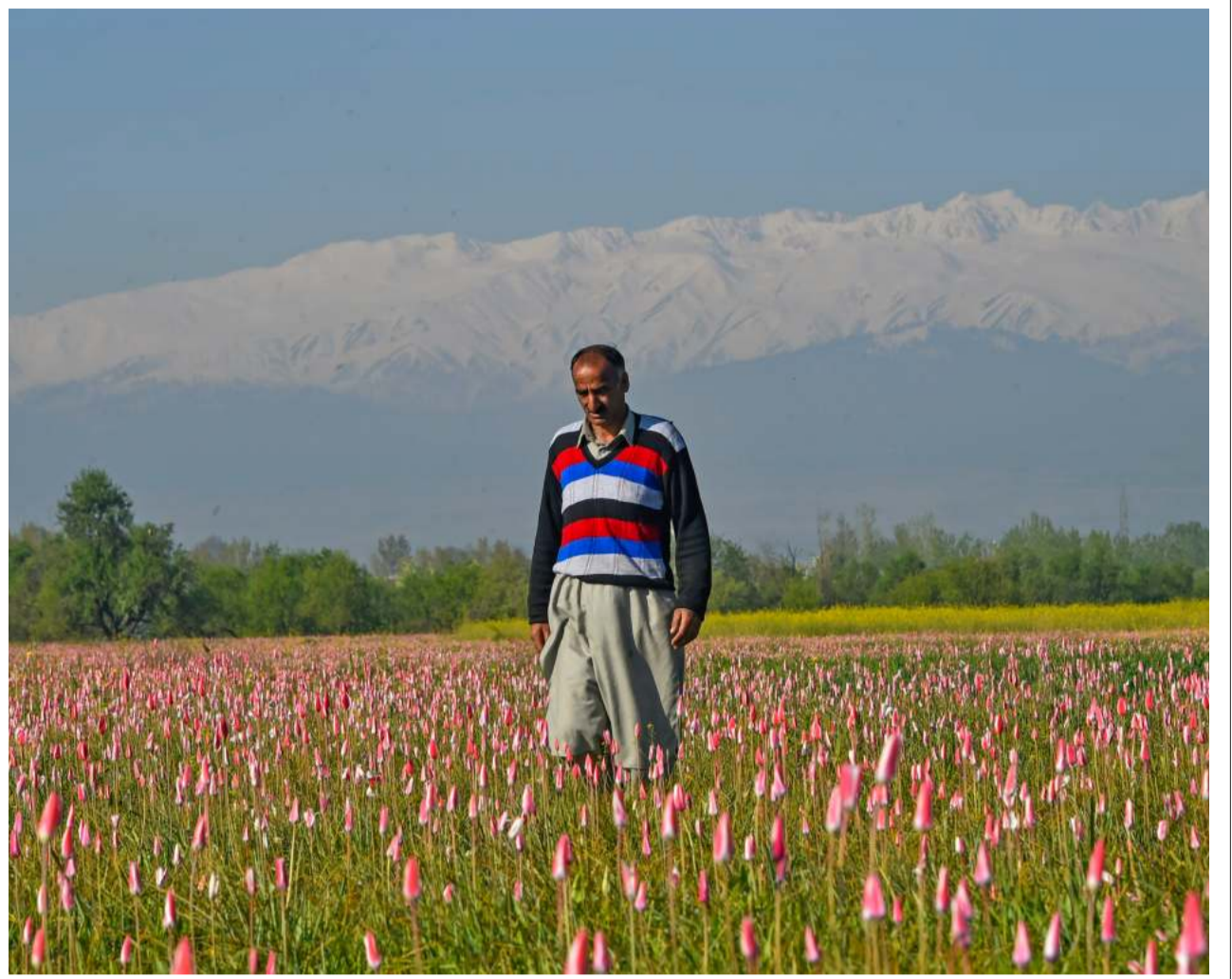
THE PICTURESQUE LANDSCAPES of Pampore Karewa in South Kashmir's Pulwama district have become a magnet for tourists, thanks to the enchanting sight of wild tulips in full bloom.

The presence of abundant garbage and leftover food inadvertently creates a secondary food source in the form of stray dogs, further enticing leopards into urban vicinities—(KNO)