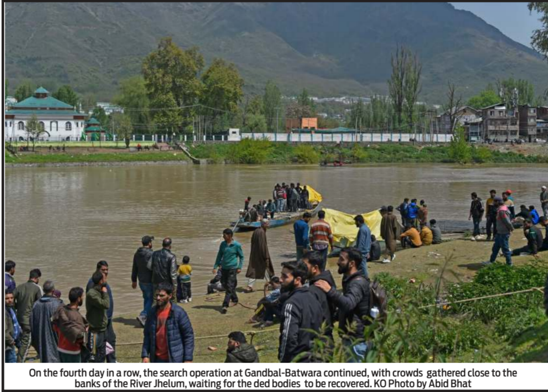
On the fourth day in a row, the search operation at Gandbal-Batwara continued, with crowds gathered close to the banks of the River Jhelum, waiting for the dead bodies to be recovered.

"We emphasize the importance of addressing this issue promptly to ensure the safety and smooth flow of traffic in the area," said Sahil, a local. He added that this issue should be sorted at the earliest.