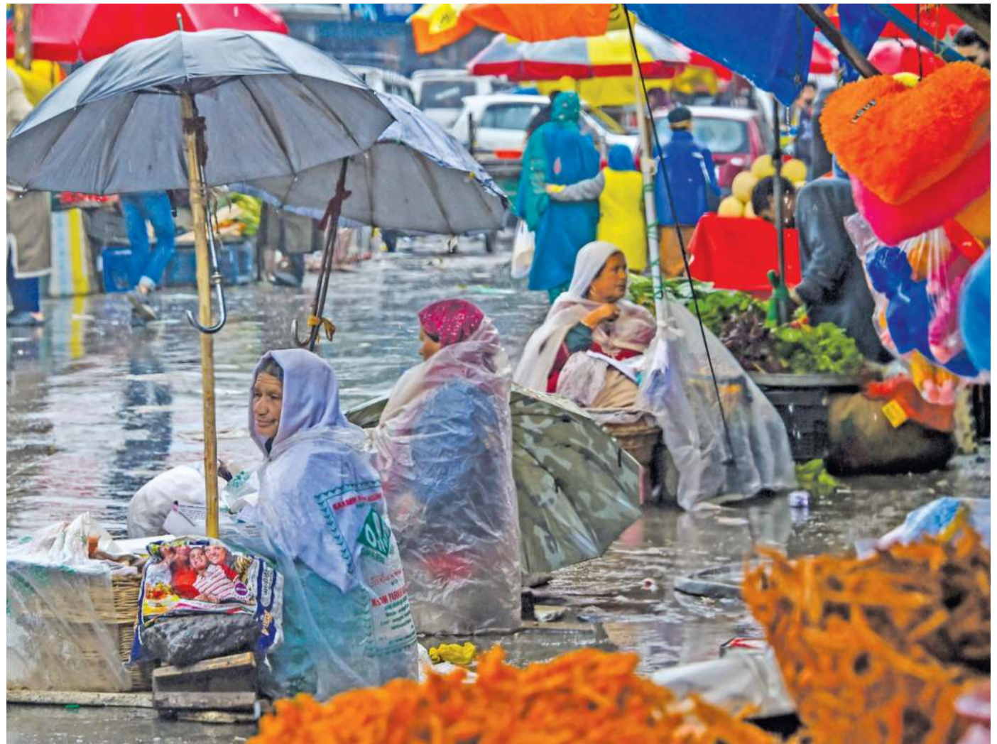
AMIDST HEAVY RAIN, a group of Kashmiri fisherwoman braves the downpour while selling fish, sheltered under an umbrella cover.

Reports inform KNO further that among the pending recruitments, the JKSSB is tasked with filling 4022 posts of police constables and 700 posts of Police Sub-Inspectors (PSIs) under the Home Department. Similarly, the JKPSC is also expected to experience delays in notifying new job posts. "Any further recruitment initiatives will only commence after the enforcement of the code of conduct. However, it's important to note that the new reservation rules will not be applicable to posts notified before March 15. Recruitment to these posts will proceed according to the pre-existing reservation rules," a senior official privy to the development told KNO—(KNO)