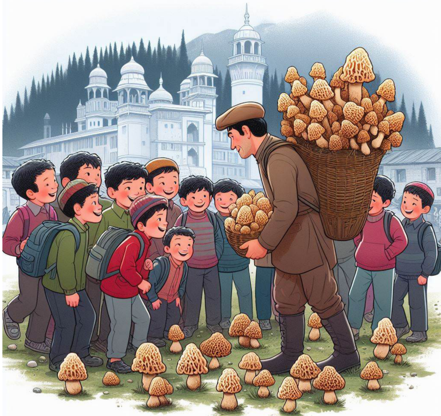
AI generated image