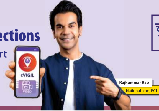
Rajkumar Rao National Icon, ECI