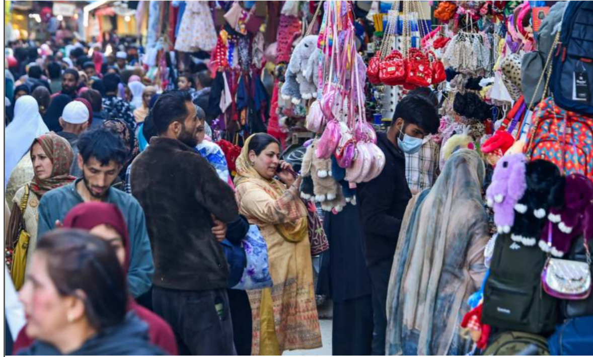
Marketplaces were bustling with activities from consumers, a day before Eid-ul-Fitr in Srinagar on Tuesday

Pertinently, 'Navratra' is a time when Hindus celebrate the goddess Durga for killing the demon, Mahishasura. A more powerful God, Lord Brahma, had blessed Mahishasura with the gift of immortality because of his dedication to him, which meant he could never die-KNO