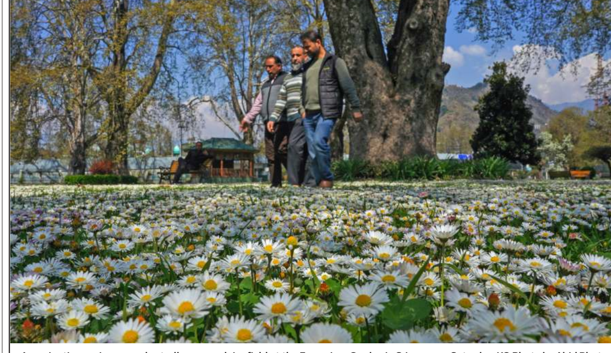
As springtime arrives, people stroll across a daisy field at the Emporium Garden in Srinagar on Saturday.