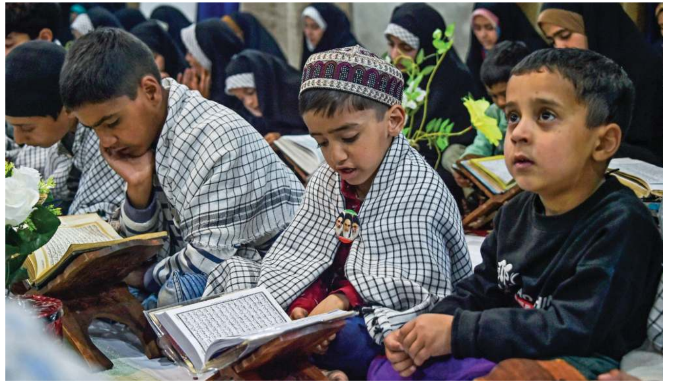
Children attend Quran recitation classes during Ramazan in the interiors of Dal Lake.

The Roshni Scam, which has seen the registration of 11 FIRs by the CBI, implicating prominent figures such as former minister Lal Singh's wife, former minister Abdul Ghani Kohli, and former Chief Minister Farooq Abdullah. The scam involves approximately Rs 25,000 crore and spans about 25 lakh kanals of land. | More on P6