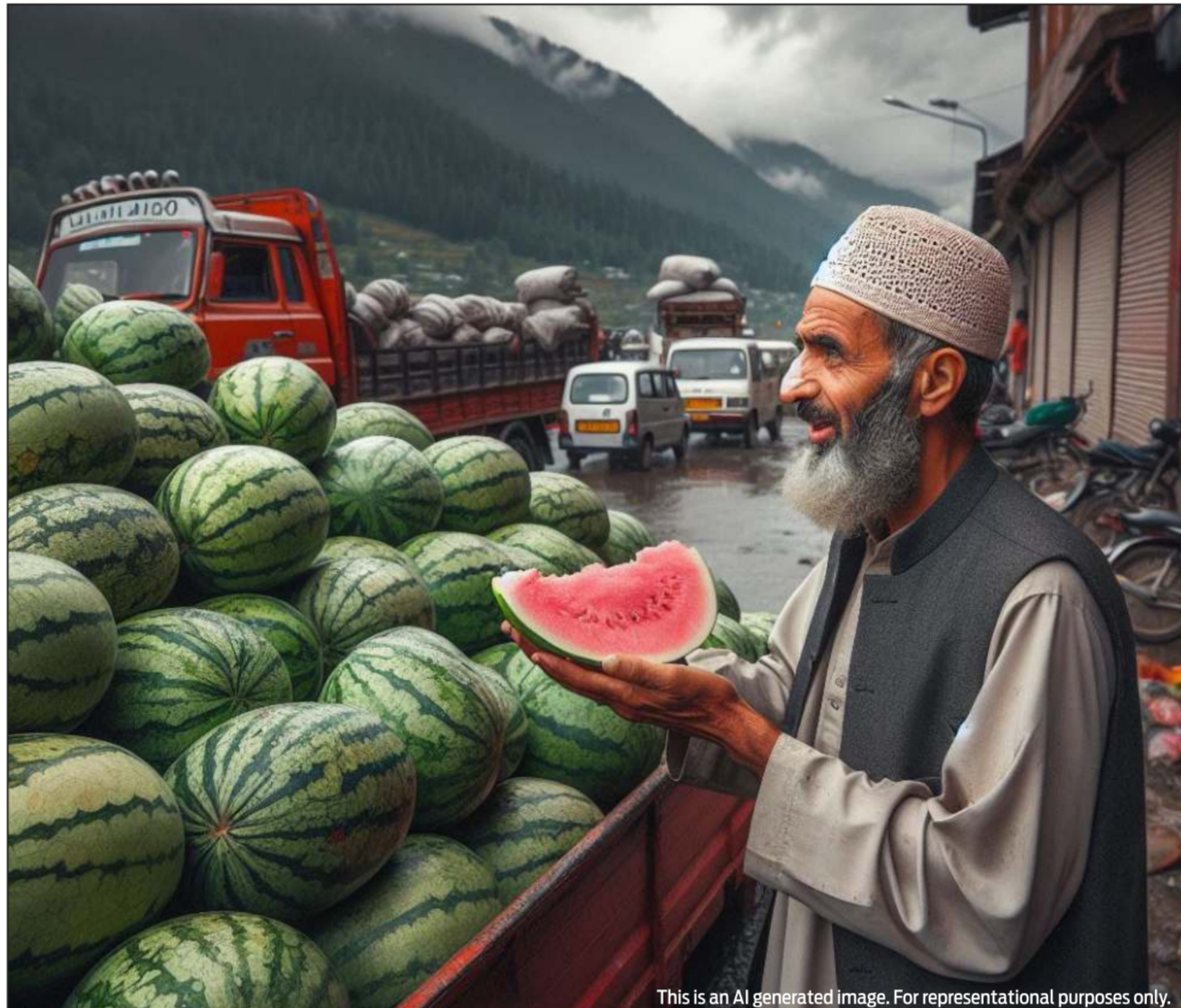
This is an AI generated image. For representational purposes only.

According to surveys conducted by reputed researchers and institutions, edible oils are polluted with adulterants like argemone and rice bran oils. Cooking oils are contaminated with illicit carcinogenic food colourants like metanil yellow. Ironically, the verboten food colourant is extensively used in India which jeopardises our lives terribly.