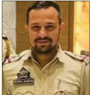
injuries in the incident.