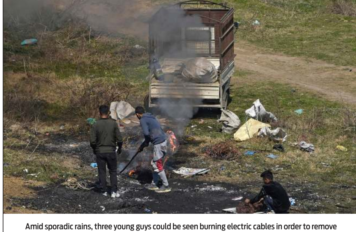
the copper wire from them near Nigeen Lake in Srinagar on Thursday.