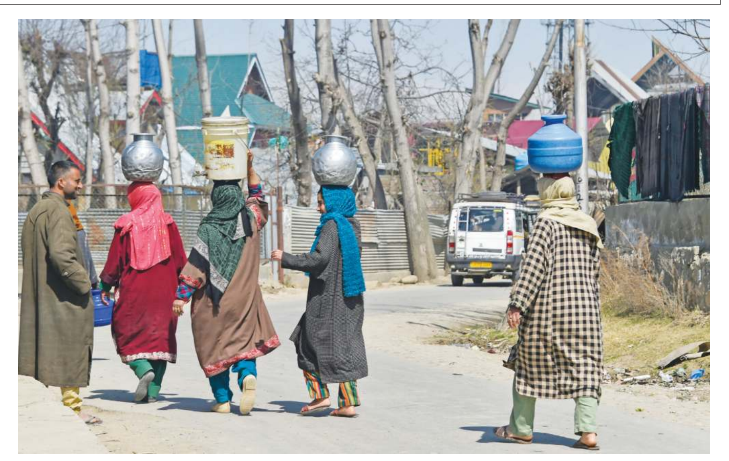
WORLD WATER DAY 2024: Women carry water-filled pots after collecting water from a stream in Khanpat village of Baramulla's Pattan area.

While the weather is expected to remain dry during March 25 and 26, the MeT Director said on March 27 to March 29, the weather would remain generally cloudy with possibility of light rain and | More on PO6