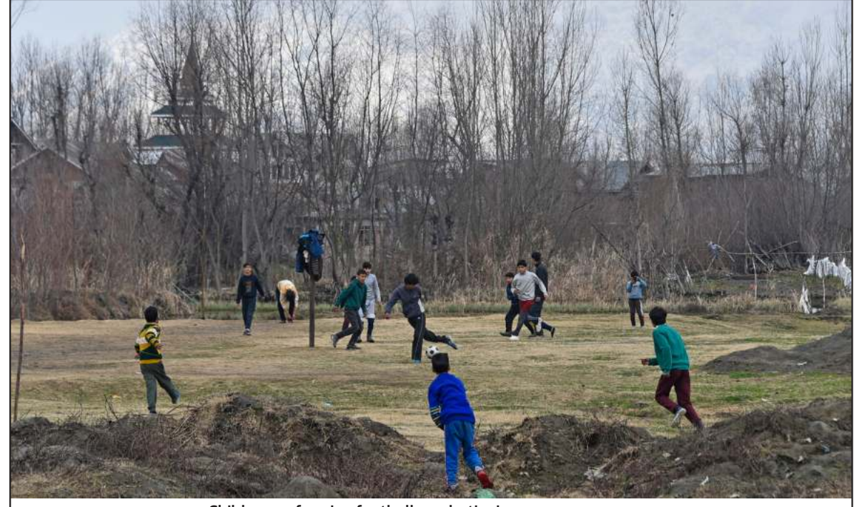
Children performing football acrobatics in an open space on a sunny Tuesday afternoon in Srinagar.

"There is a need for such industries in the region and NIT Srinagar is committed to use its resources for the benefit of the Indian Economy," they said.