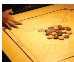
Varanasi, UP. It is being organized by All India Carrom Federation and hosted by UP State and Varanasi District

The championship will be held from March 28 to 31 in