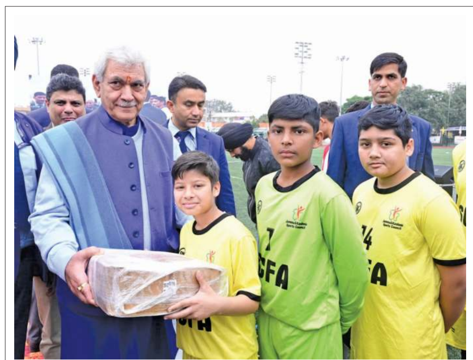
LG MANOJ SINHA interacts with Sports Council Football Academy players after inaugurating a state-of-the-art synthetic football turf, costing Rs 4.83 crore, at Parade Ground in Jammu on Wednesday.

Sinner wore down Australian Alex de Minaur to claim a 5-7 6-2 6-3 victory.