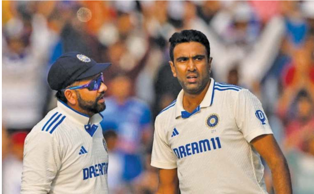
Rohit, who smashed a hundred in Dharamsala, rose five places to sixth and within 108 rating points of No 1 ranked Test batter Kane Williamson. Yashasvi Jaiswal (up two places to eighth) and Shubman

The big haul helped Ashwin move past teammate Jasprit Bumrah into the premier position that he previously held earlier this year, the ICC said in a statement.