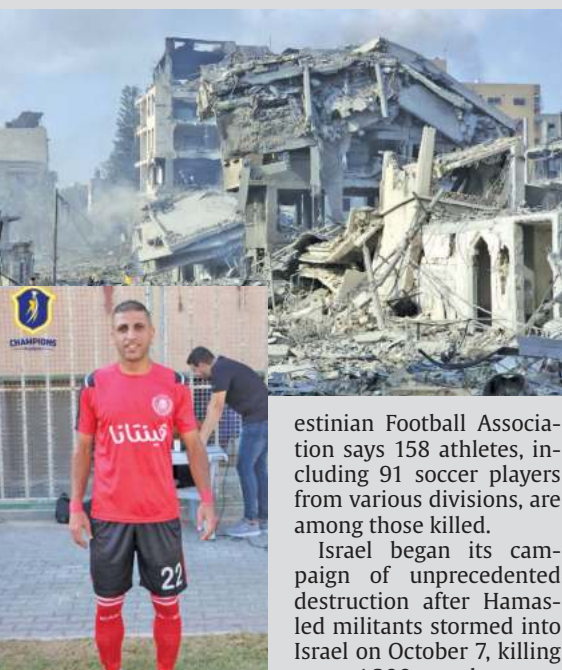
killed since the start of the Israel-Hamas war. The Palestinian Football Association says 158 athletes, including 91 soccer players from various divisions, are among those killed. Israel began its campaign of unprecedented destruction after Hamas-led militants stormed into Israel on October 7, killing some 1,200 people, mostly civilians, and taking around 250 hostages.

Gaza's Health Ministry says more than 31,000 Palestinians have been