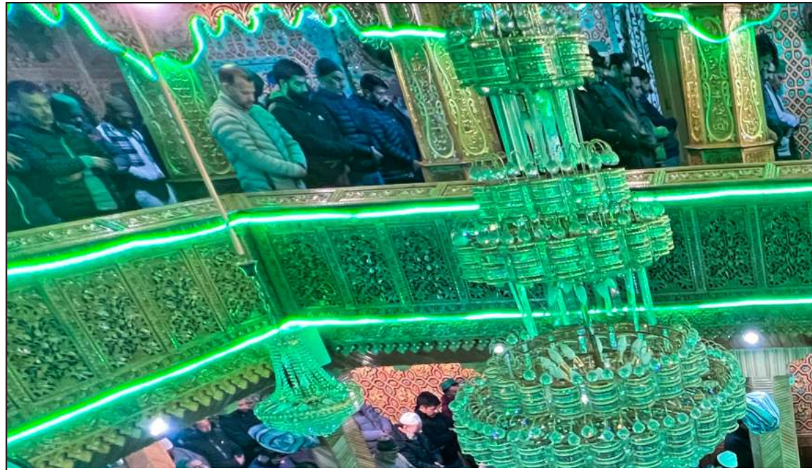
People offer (Zuhar) afternoon prayers at the exquisitely adorned shrine of Hazrat Peer Dastgeer Sahab (R.A), a Sufi saint from the eleventh century, at Khanyar area in the old city on Wednesday.

Kashmir Observer back in January this year reported the issue, but there haven't been any updates suggesting it's been fixed. Reports suggest that the conductors also are not accepting Chalo App tickets. This suggests the ticketing system for Srinagar's Smart City Buses is facing multiple challenges.