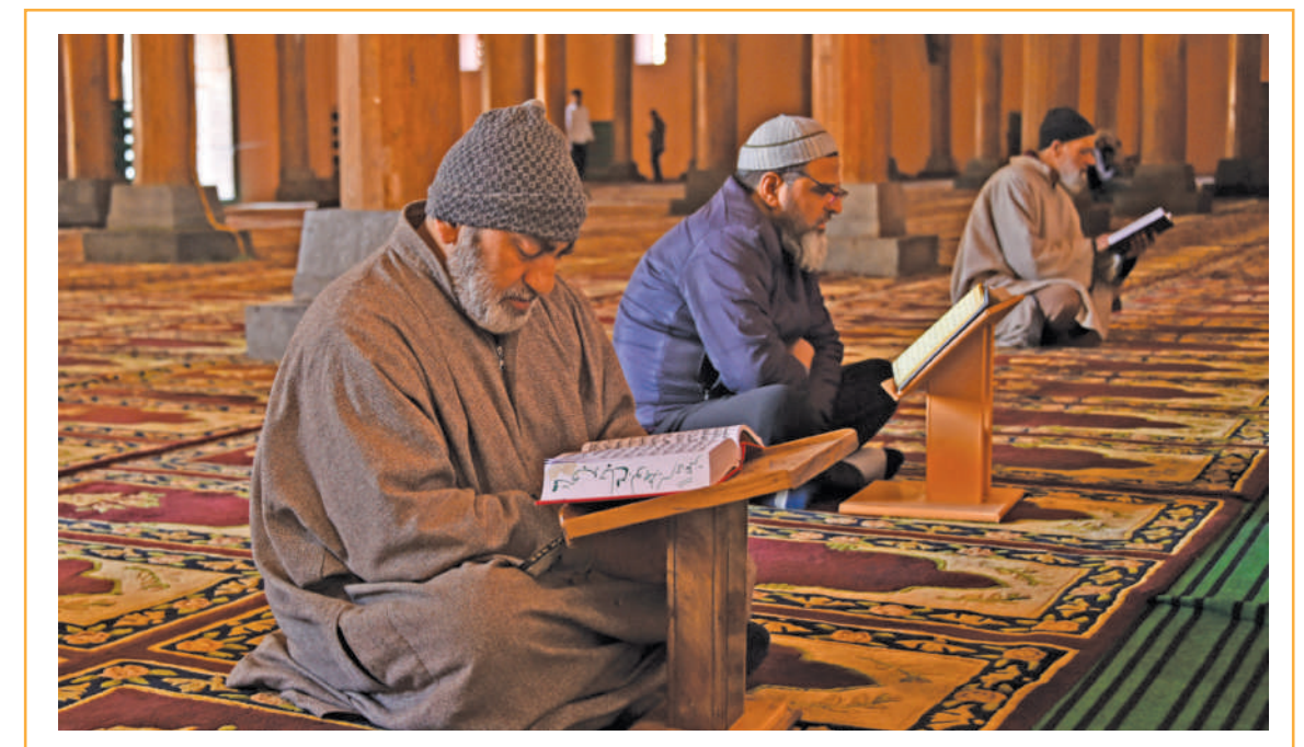
TUESDAY MARKS THE FIRST day of the holy month of Ramadan, with worshippers reciting the holy Ouran at Srinagar's central Jamia Masjid.

"With the spirit of Ramadan, Srinagar's Mandi is