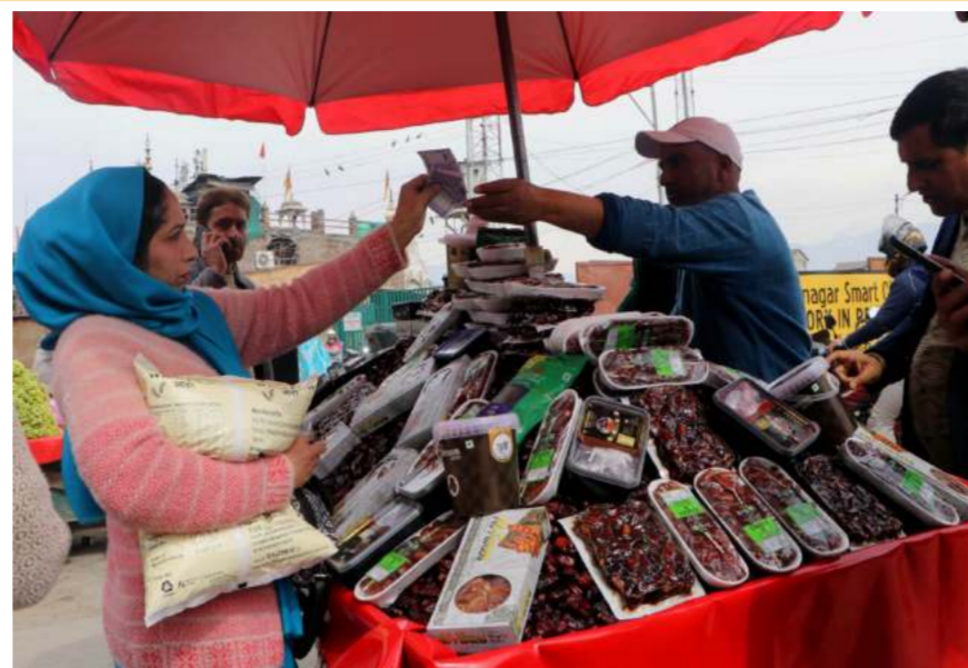
MARKETS IN SRINAGAR were crowded with customers, most of whom were purchasing dates, a day before the commencement of the holy month of Ramadan.