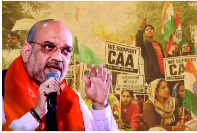
migrants -- Hindus, Sikhs, Jains, Buddhists, Parsis and Christians -- from the three countries. Union Minister Amit Shah said Prime Minister Narendra Modi has delivered on another

The rules were notified days ahead of the expected announcement of the Lok Sabha elections. With this, the Modi government will now start granting Indian nationality to persecuted non-Muslim