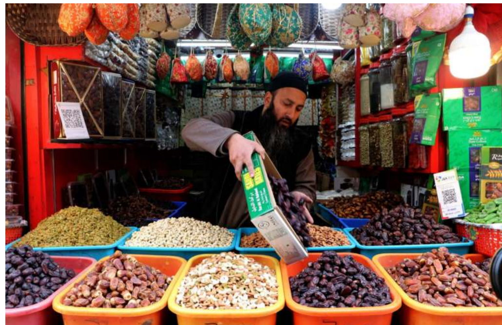
A shopkeeper in Srinagar sorts dates, as Ramazan in Kashmir starts from today.

Azad Party chairman Ghulam Nabi Azad has been elected to the Rajya Sabha twice with National Conference's help and the difference in the "ferocity" of his attacks towards the NC and the BJP showed the leader's "agenda", former Jammu and Kashmir chief | More on P11