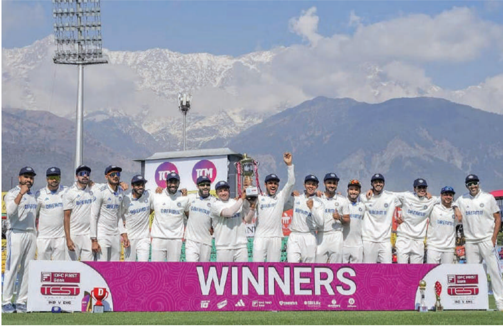
India, with 122 rating points, are five points ahead of Australia in the Test ranking, while

Australia, the reigning World Test Championship winners are leading the two-Test series 1-0 following their 172-run victory in Wellington.