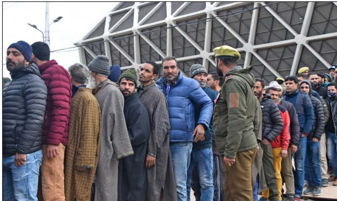
People in large numbers lining up at Bakshi Stadium in Srinagar to attend Prime Minister Narendra Modi's mega rally on Thursday.

While highlighting the activities undertaken by WDC for women empowerment, she stated that under various loan schemes Corporation has disbursed an amount of Rs. 327.49 crores benefitting 23058 women beneficiaries by establishing their own income generating units.