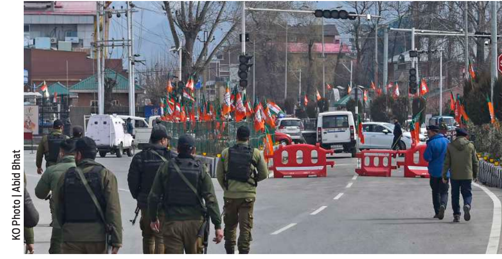
KO WEB DESK

Anticipation Mounts For Development Packages