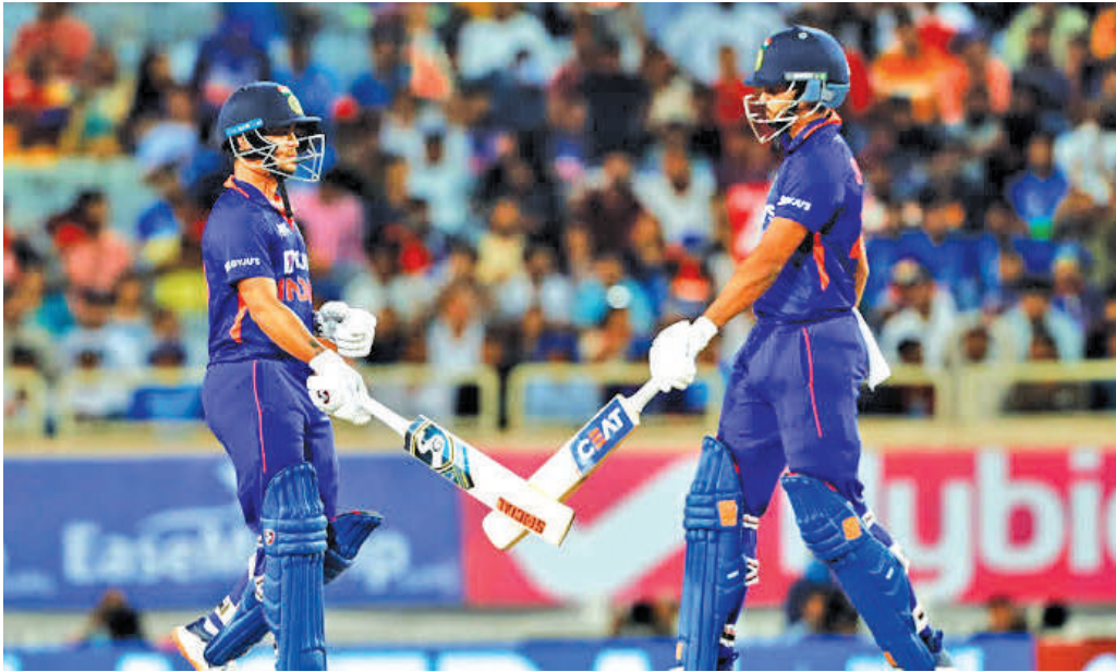
Mohammed Shami, Mohammed Siraj, KL Rahul, Shubman Gill and Hardik Pandya. Suryakumar Yadav, Rishabh Pant, Kuldeep Yadav, Axar Patel and Yashasvi Jaiswal have got B

Six cricketers feature in the A category, including R Ashwin,