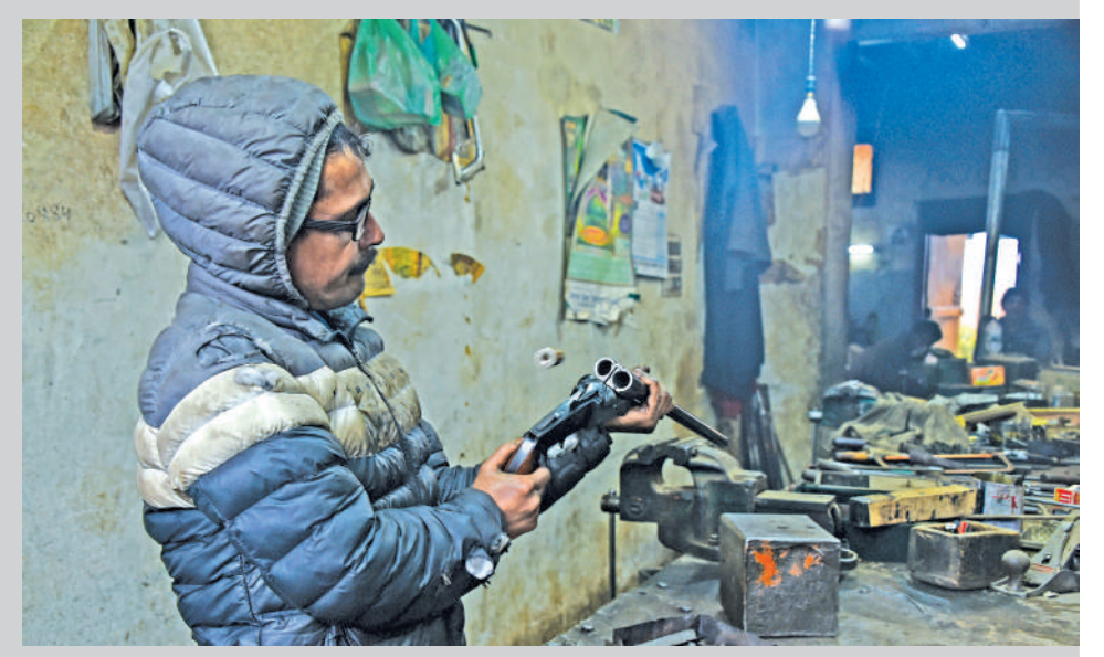
ZAROO GUN FACTORY IN RAINAWARI area of Srinagar, Kashmir's one of the last surviving gun factories is facing a bleak future and gun makers are struggling for their survival.

"Earlier, cross-border shelling was a routine but now peace is prevailing on the borders and new opportunities are opening for the villagers," he said, adding that the border residents want everlasting peace so that the people, who are mostly farmers, can tend their land on both sides without any fear.