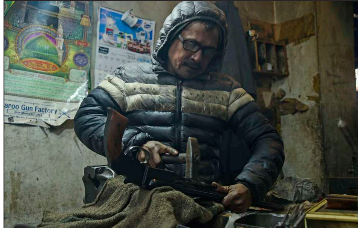
Gunsmiths with expertise may only repair handmade rifles at the Zaroo Gun Factory in Srinagar, in view of the ban on sale and manufacture of fresh stock of weaponry.