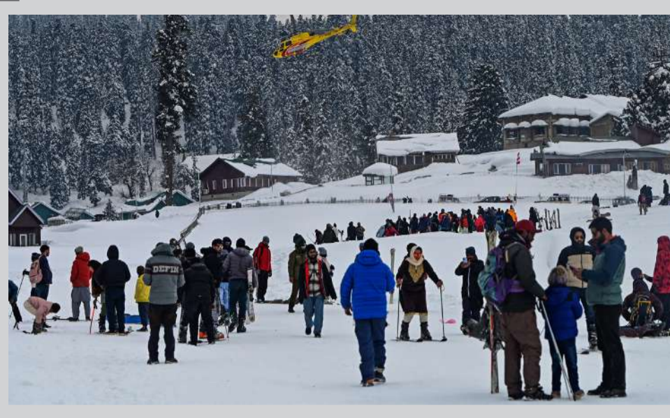
A GROUP OF TOURISTS enjoying skiing amidst the scenic beauty of Gulmarg.

The meeting served as a vibrant forum for exchanging ideas and recommendations, setting a positive trajectory for the development of a tourism plan that not only aims to enhance Ganderbal's tourism appeal but also ensures the sustainability of its natural and cultural heritage.