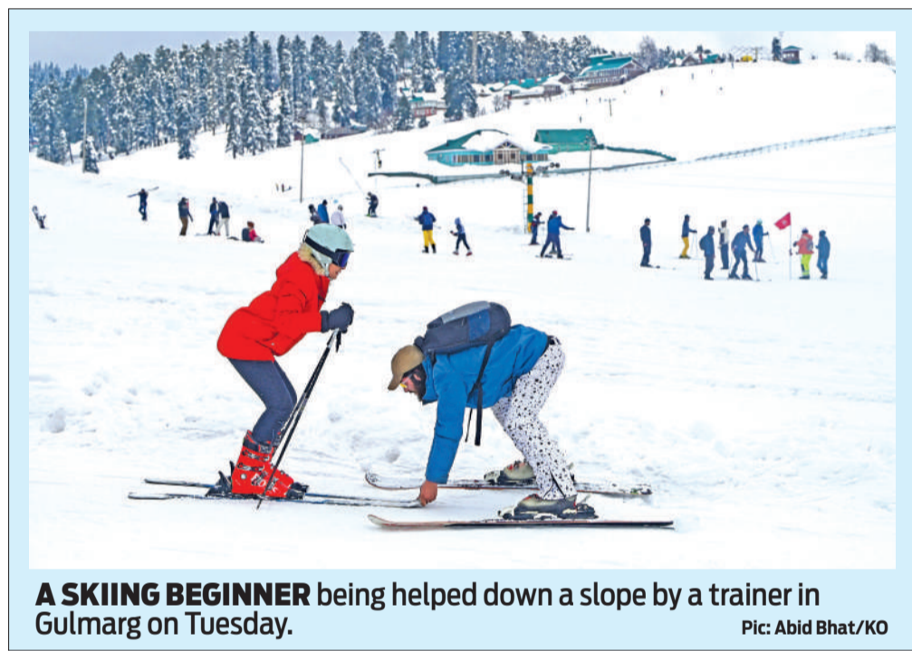
A SKIING BEGINNER being helped down a slope by a trainer in Gulmarg on Tuesday.