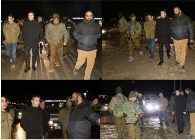
regulation on service roads so that commuters do not face any difficulty particularly the

During the inspection, the DC passed spot directions to the concerned executing agencies to ensure smooth Traffic