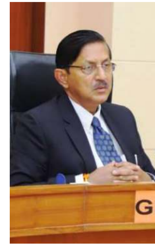
minimize human error. The General Manager reviewed the progress of enhancement of passenger amenities and other ongoing projects and instructed the