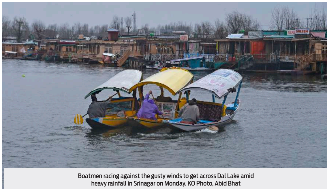
Boatmen racing against the gusty winds to get across Dal Lake amid heavy rainfall in Srinagar on Monday.

A local from the Qamarwari area of Srinagar told the news agency Kashmir News Trust over the phone that the long power cuts have irked the people. "The KPDCCL sucks the blood of poor people, dispatching fatty bills but not offering decent service," he said. KNT