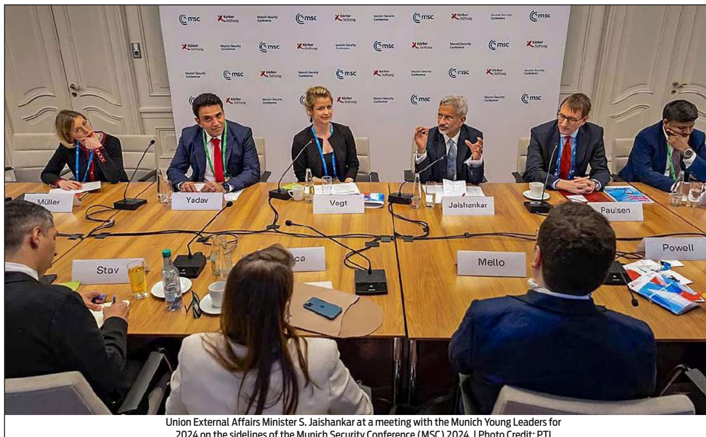
Union External Affairs Minister S. Jaishankar at a meeting with the Munich Young Leaders for 2024 on the sidelines of the Munich Security Conference (MSC) 2024.

The Munich Security Conference (MSC) 2024 was underway in the background of the continued war in Palestine. Significantly, India's external affairs minister made India's position on Palestinian statehood clearer at the conference, besides holding talks with other global leaders