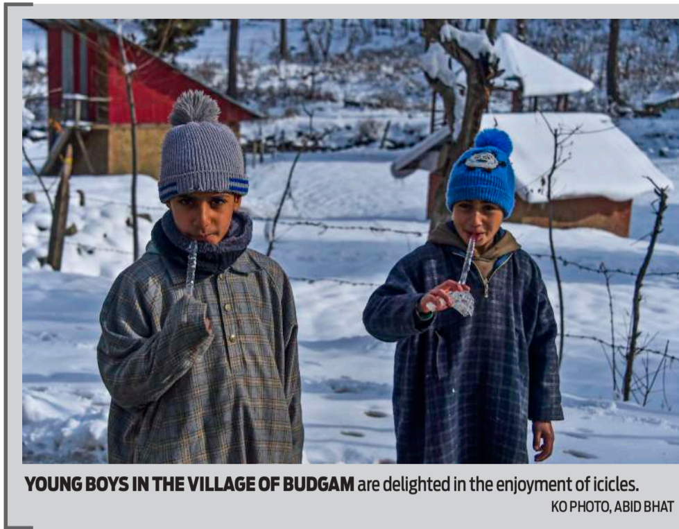
YOUNG BOYS IN THE VILLAGE OF BUDGAM are delighted in the enjoyment of icicles.