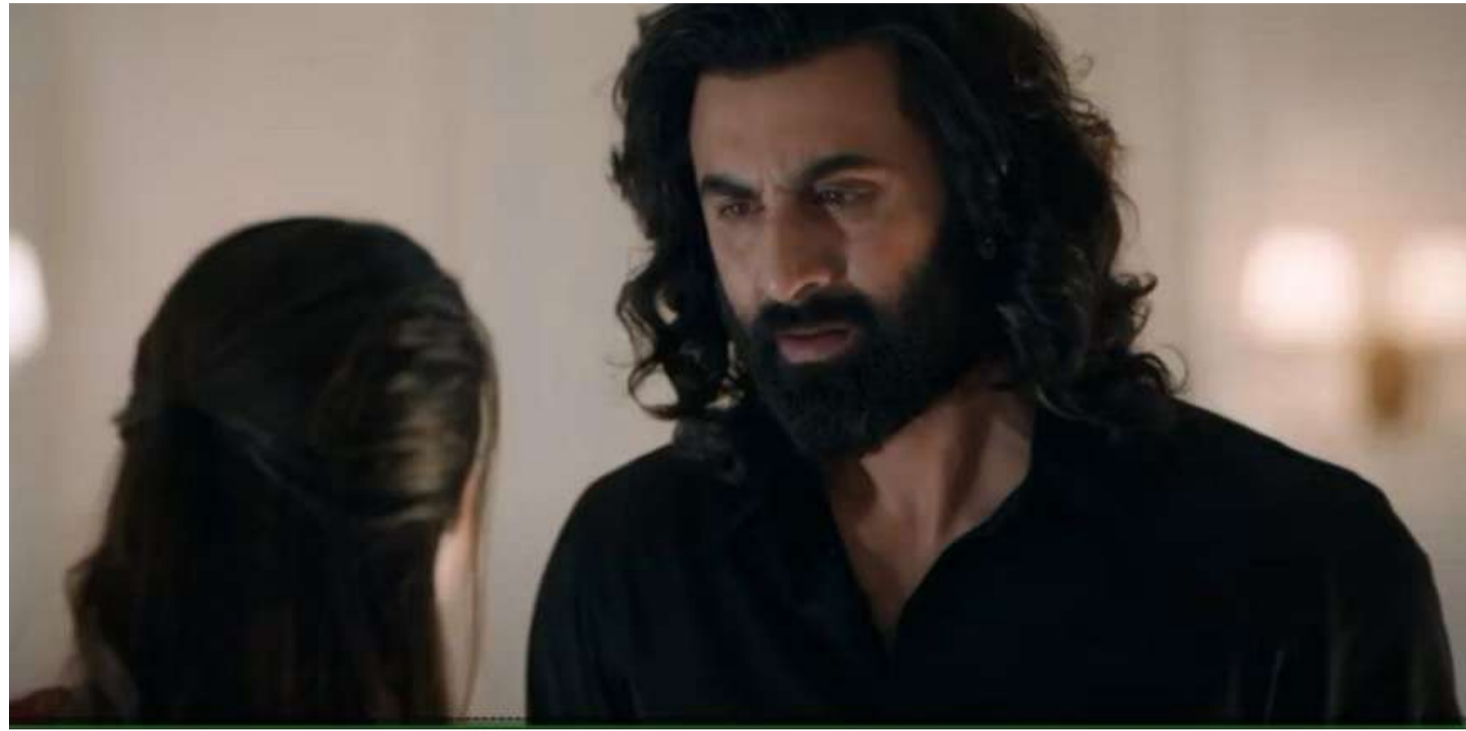
A still from recently released Bollywood movie "Animal"

The insidious impact of movies showcasing toxic masculinity extends beyond entertainment, seeping into the minds of the Indian audience. A disconcerting trend emerges as audiences seemingly prefer narratives glorifying toxic masculinity