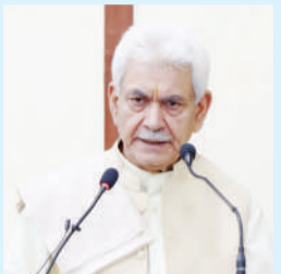
LG LAUDS INTERIM BUDGET

Srinagar: Lieutenant Governor Manoj Sinha lauded J&K UT's Interim Budget 2024-25 and expressed gratitude to the Prime Minister Narendra Modi and Finance Minister Nirmala Sitharaman.