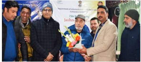
Anantnag, on his superannuation on Wednesday.