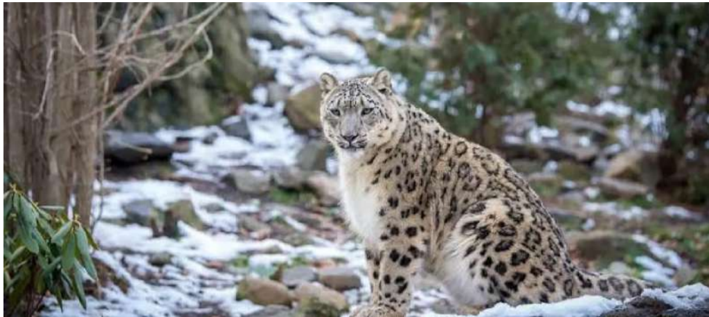
by Uttarakhand (124), Himachal Pradesh (51), Arunachal Pradesh (36), Sikkim (21), and J&K (9).

The Wildlife Institute of India, in collaboration with Nature Conservation Foundation and WWF-India, conducted the assessment covering 70% of the potential snow leopard range. Ladakh leads with 477, followed