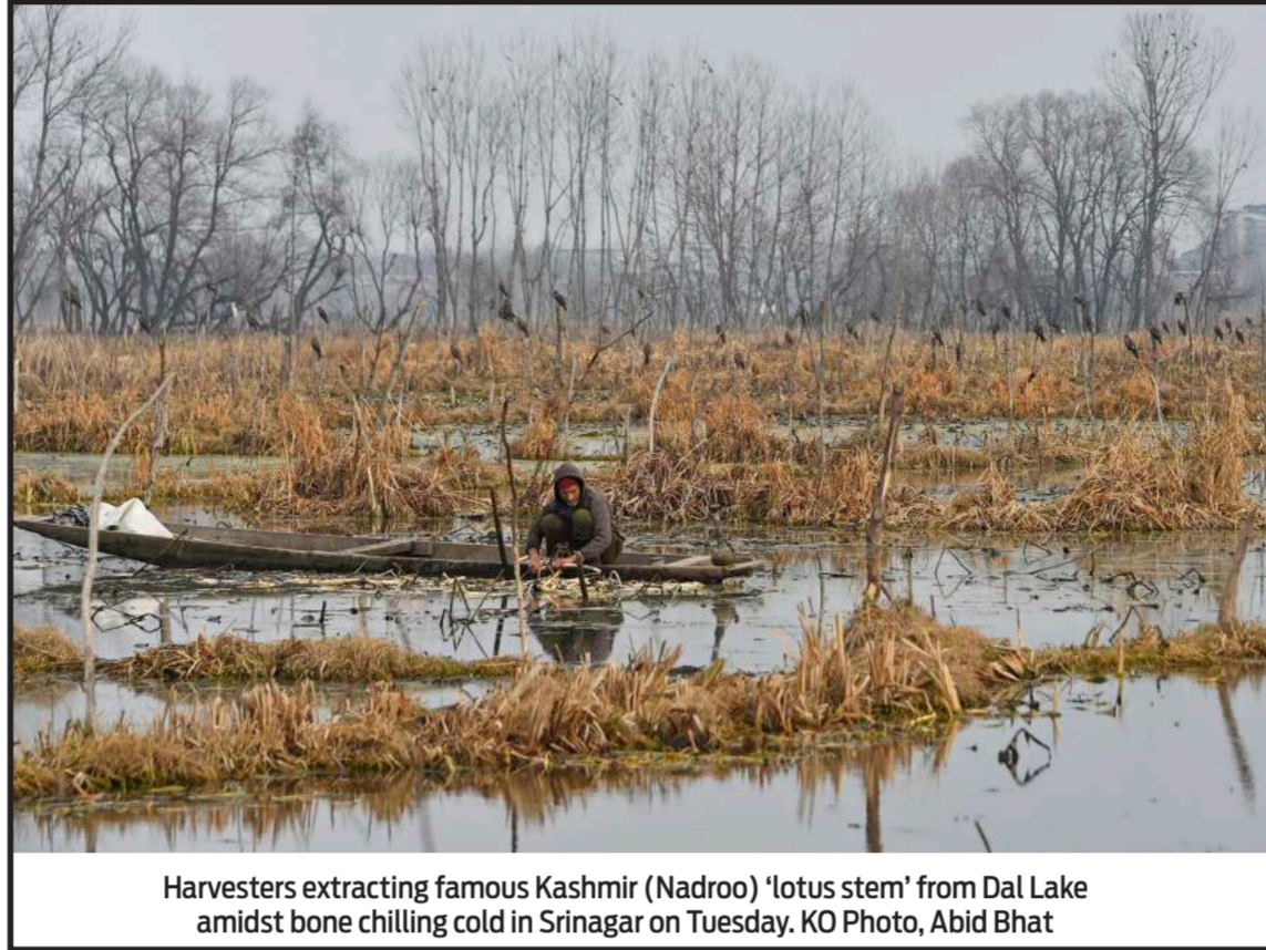
Harvesters extracting famous Kashmir (Nadru) 'lotus stem' from Dal Lake amidst bone chilling cold in Srinagar on Tuesday.

He added, "All the neighbors have been present since last night, and we hope the brotherhood will continue in the valley as we are overwhelmed."