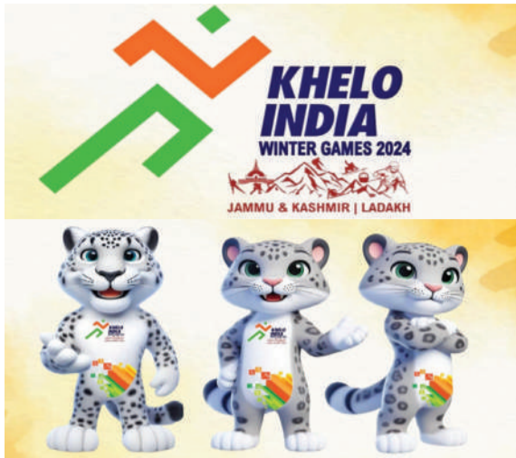
the mascot for Winter Games, Snow Leopard, is the symbol of Himalaya's natural heritage and re-

flects the commitment of the government towards the protection and preservation of wildlife.