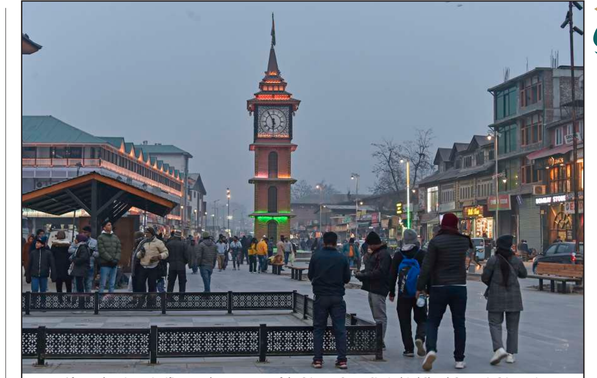
After undergoing a significant makeover as part of the Srinagar Smart City Ltd, Lal Chowk Square in Srinagar is teeming with locals and visitors alike with dazzling evenings becoming a norm.

of Traffic Police Srinagar appealed to the people to inform police in case of any violation in this direction.