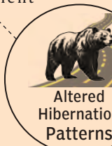
Altered Hibernation Patterns

loss barely stops with wistful nostalgia; the loss of snowfall is real, worrisome and manifold spread not just over the much-lamented horticulture and electricity generation, but also over less talked fisheries and wildlife. Experts say that the low-pressure system over Himalaya is largely