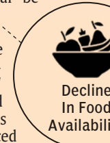
Decline In Food Availability