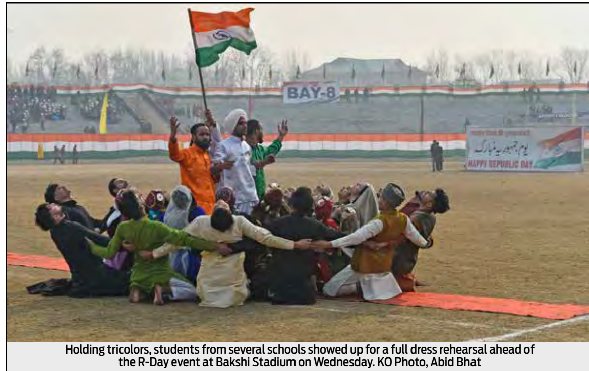
Holding tricolors, students from several schools showed up for a full dress rehearsal ahead of the R-Day event at Bakshi Stadium on Wednesday.

The DC asked the organizers to launch mass awareness regarding Women Centric Schemes, Skill Development, BBBP and Legal Services through such programs to achieve desired targets at ground level