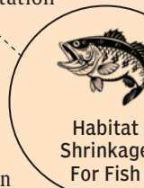
Habitat Shrinkage For Fish

January 31, the gaping snow deficit will remain, and thus the dangers occasioned by its absence will persist. "The reduced precipitation over an extended period in temperate regions could have a profound impact on wildlife in Kashmir Himalaya. The scarcity of snowfall translates to