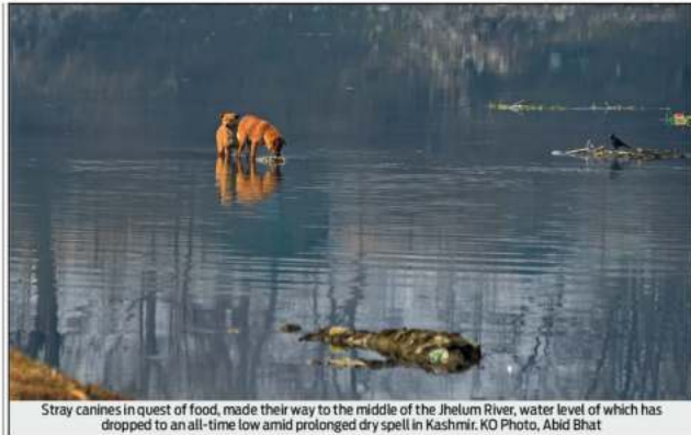
Stray canines in quest of food, made their way to the middle of the Jhelum River, water level of which has dropped to an all-time low amid prolonged dry spell in Kashmir.