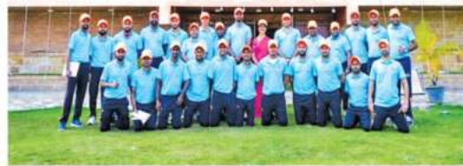
Observer News Service

SRINAGAR: Four cricketers from Kashmir Valley were on Sunday named in the Indian Physically Disabled Men's Team for the five-match T20 series against England. The series will be played in