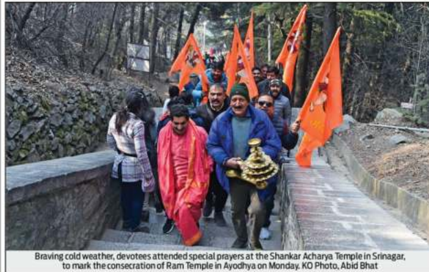
Braving cold weather, devotees attended special prayers at the Shankar Acharya Temple in Srinagar, to mark the consecration of Ram Temple in Ayodhya on Monday.

"The rejuvenation project is expected to bring about a significant facelift to the Karan Nagar Gole market on the possible modernized lines," he said.