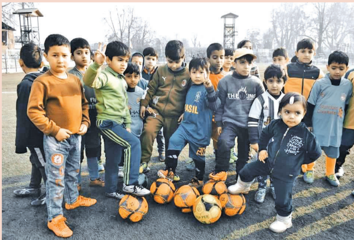
Children train at J&K Sports Council's 'Football School' at Synthetic Turf TRC in Srinagar.

In 2014, Kashmir got its first exclusive football stadium with an all-weather synthetic turf. This was followed by the emergence of many new clubs including Real Kashmir Football Club in 2016, which went on to win the Indian Football Association (IFA) Shield in 2020.