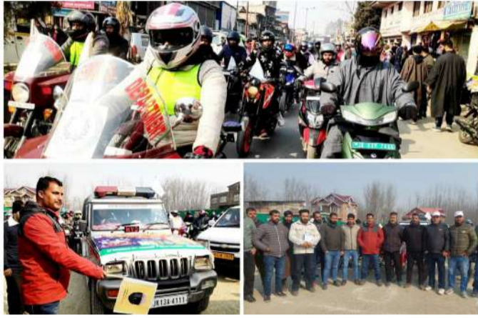
and pedestrians about safe driving and importance traffic guidelines. Not following the rules and guidelines is a danger to both the drivers of the vehicles but also the pedestrians and others.

Dr. Zubair said that Road Safety Month is a national event aimed at raising public awareness about rules and regulations on road safety and to urge people to follow them. It educates drivers