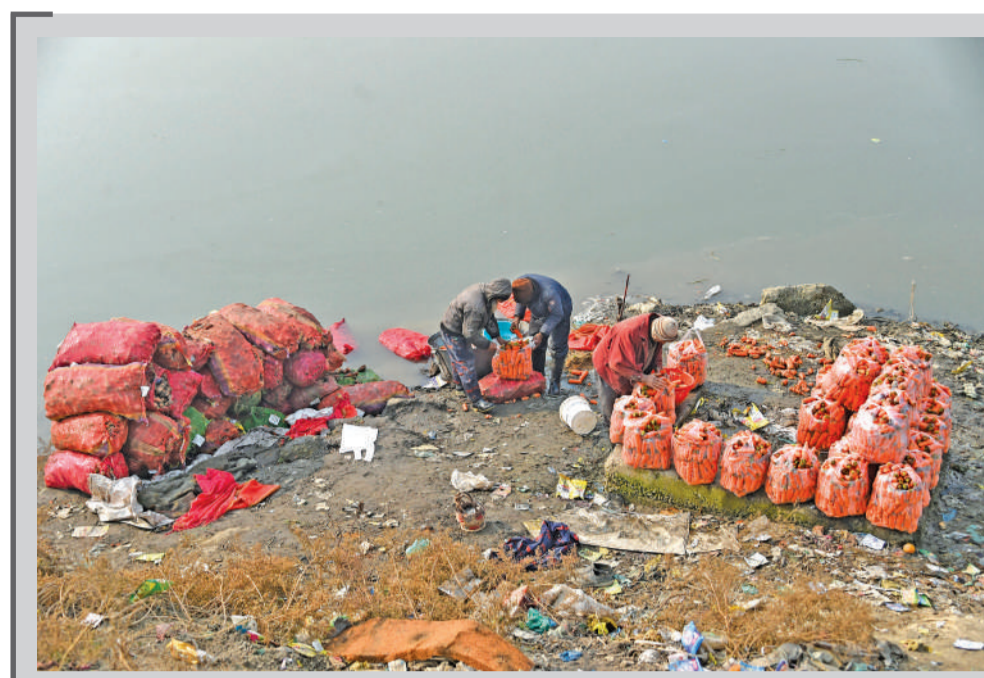
NON-LOCAL LABORERS PACKAGING carrots into plastic bags after cleaning them along the banks of the dried-up Jhelum River in Srinagar on Saturday.

During his visit, the DC kick started the National Girl Child Week 2024 under Bati Bachao Beti Padhao with the signature ceremony to save the Girl Child and educate them at the office of the District Hub for Empowerment of Women Srinagar.