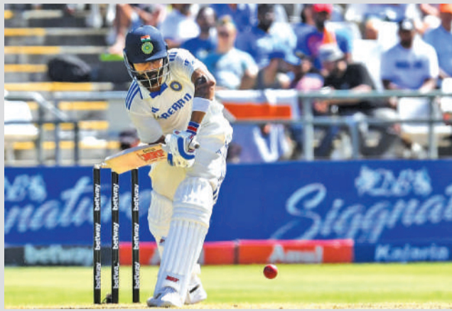
INDIA VS ENGLAND 5 TESTS

"Yeah, conversion means having more hundreds than fifties. With Kohli, he has as