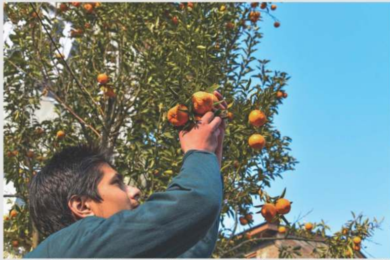
Amidst the warming weather in Kashmir, a young boy picks ripe oranges in an orchard in Srinagar. In the days of yore, who would have imagined that tropical fruits like lemon and oranges would find a home in the lush Kashmir valley? Yet, unexpectedly, the changing climate patterns have granted the zestful fruits a new territory to flourish.

The officials said scores of tourists have returned home from Kashmir dejected without getting a feel of snow. A large number of tourists, who arrived here around the New Year's Eve in the hope of enjoying skiing and other snow-related activities in the | More on P6