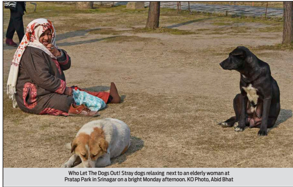
Who Let The Dogs Out! Stray dogs relaxing next to an elderly woman at Pratap Park in Srinagar on a bright Monday afternoon.

The Officers of the concerned Departments briefed the DC about the status of coverage of beneficiaries under various self-employment schemes in the District.