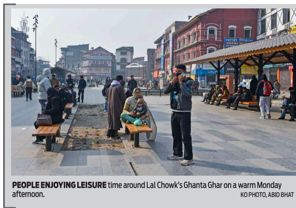
PEOPLE ENJOYING LEISURE time around Lal Chowk's Ghanta Ghar on a warm Monday afternoon.

The home ministry emphasised that the MLJK-MA and its members show disrespect towards the constitutional authority and setup of the country.