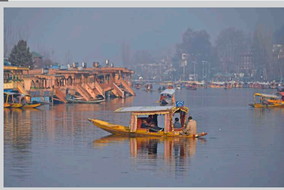
TOURISTS ENJOYING SHIKARA ride on a warm winter afternoon in Srinagar's Dal Lake on Saturday.

He has also been accused of having links with Al Badr, another terrorist outfit.