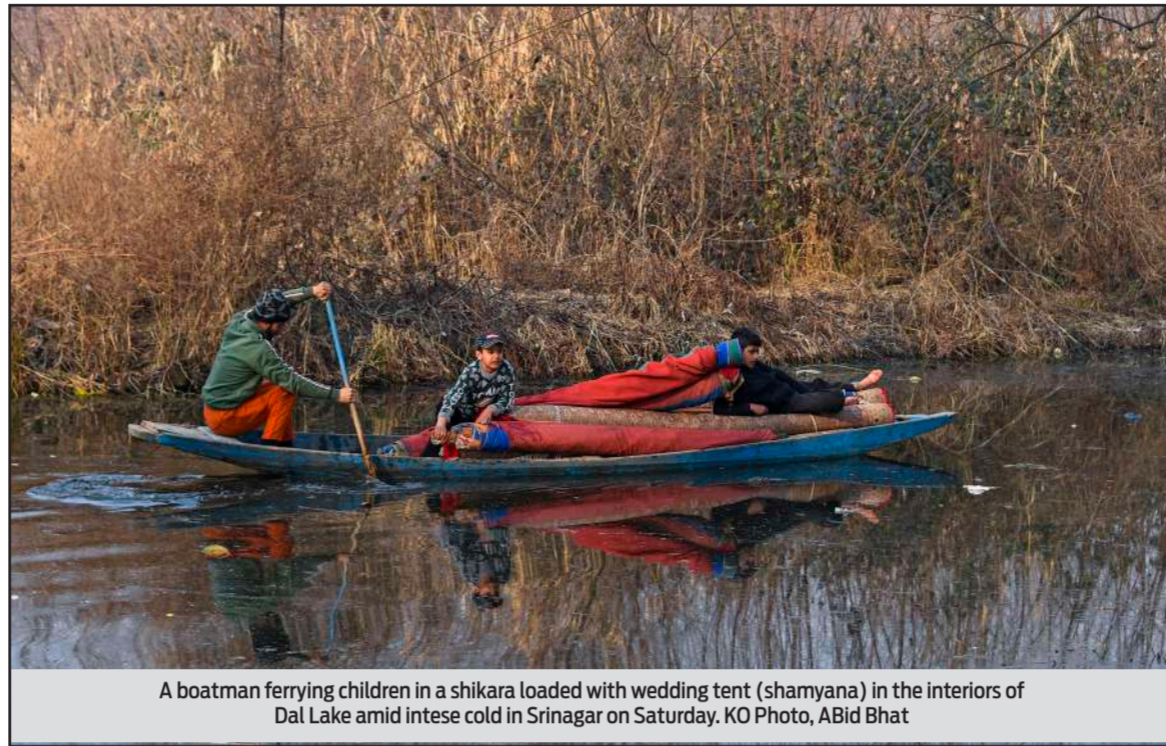
A boatman ferrying children in a shikara loaded with wedding tent (shamyana) in the interiors of Dal Lake amid intense cold in Srinagar on Saturday.

"We, along with officials from the geological and mining department and police officials, conduct surprise checks and raids after receiving complaints and necessary action will follow in this regard as well," he added