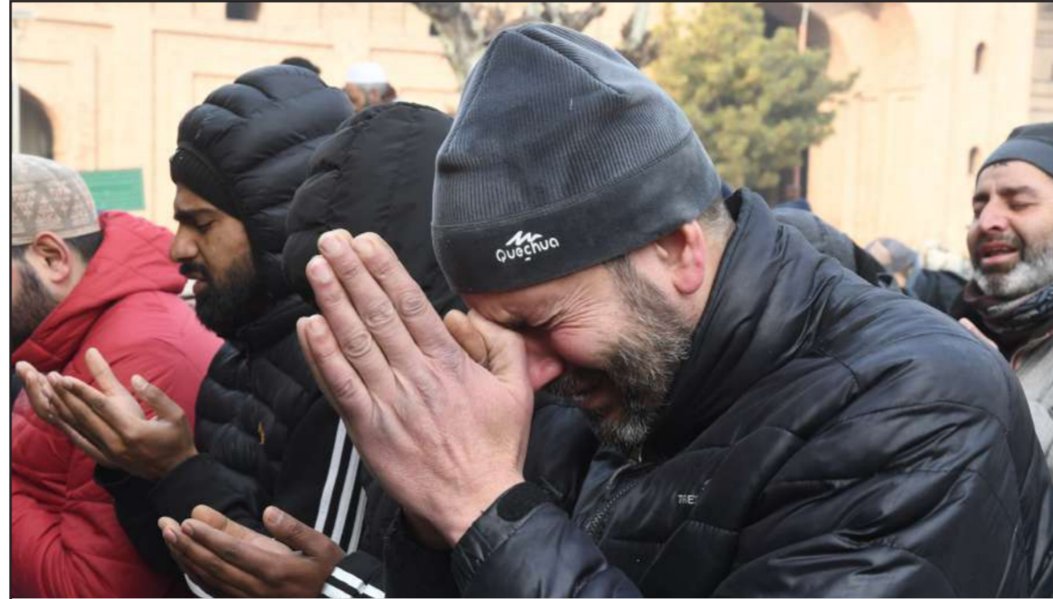
While Salat-ul-Istisqa was held at the central Jamia Masjid in Srinagar on Friday, the faithful were seen crying before Almighty Allah, seeking respite from unprecedented dry weather conditions.