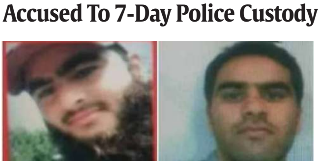
Press Trust Of India

was suffering | More on P6 he Supreme Court Collegium has recommended the names of Justice Moksha