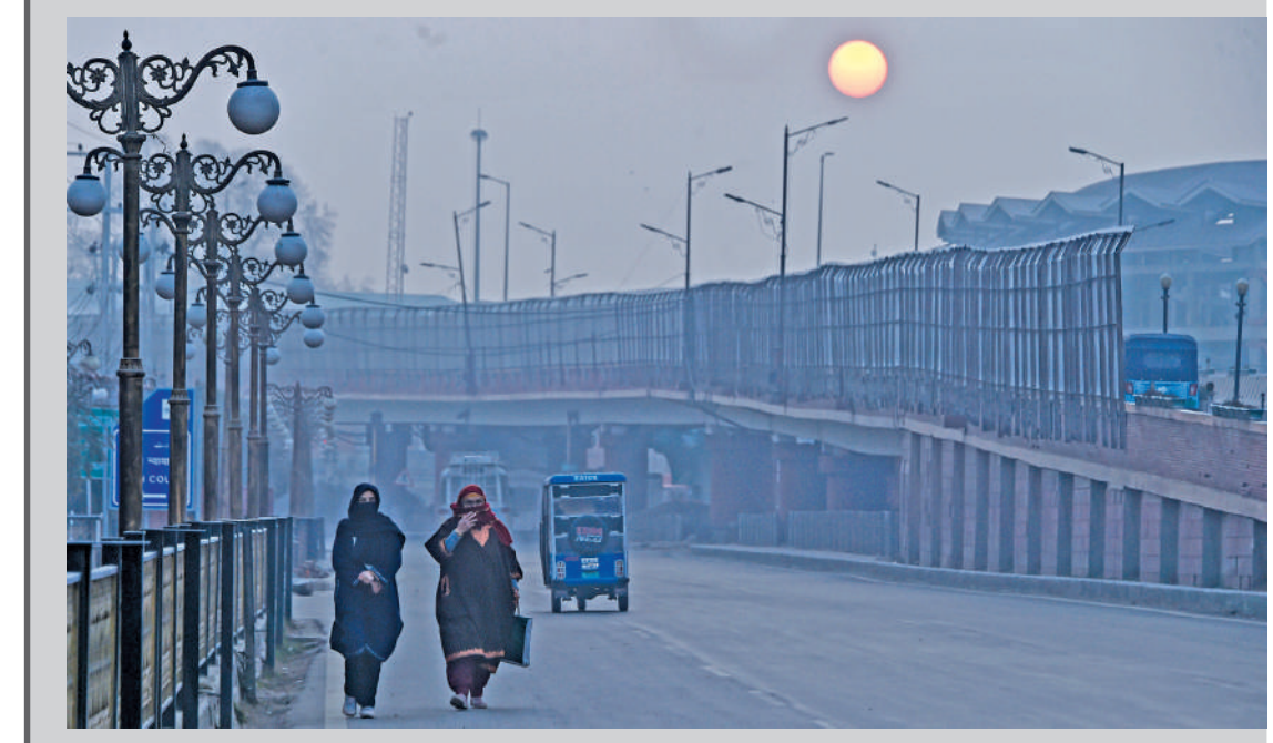
TWO WOMEN COVERING THEIR FACES with shawls pass through Jehangir Chowk in Srinagar on a cold Friday morning as the sun rises in the background..