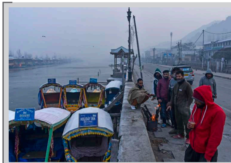
AS SHIKARAS REMAIN ANCHORED, the boatmen warming themselves at the banks of Srinagar's Dal Lake on a cold Wednesday morning.