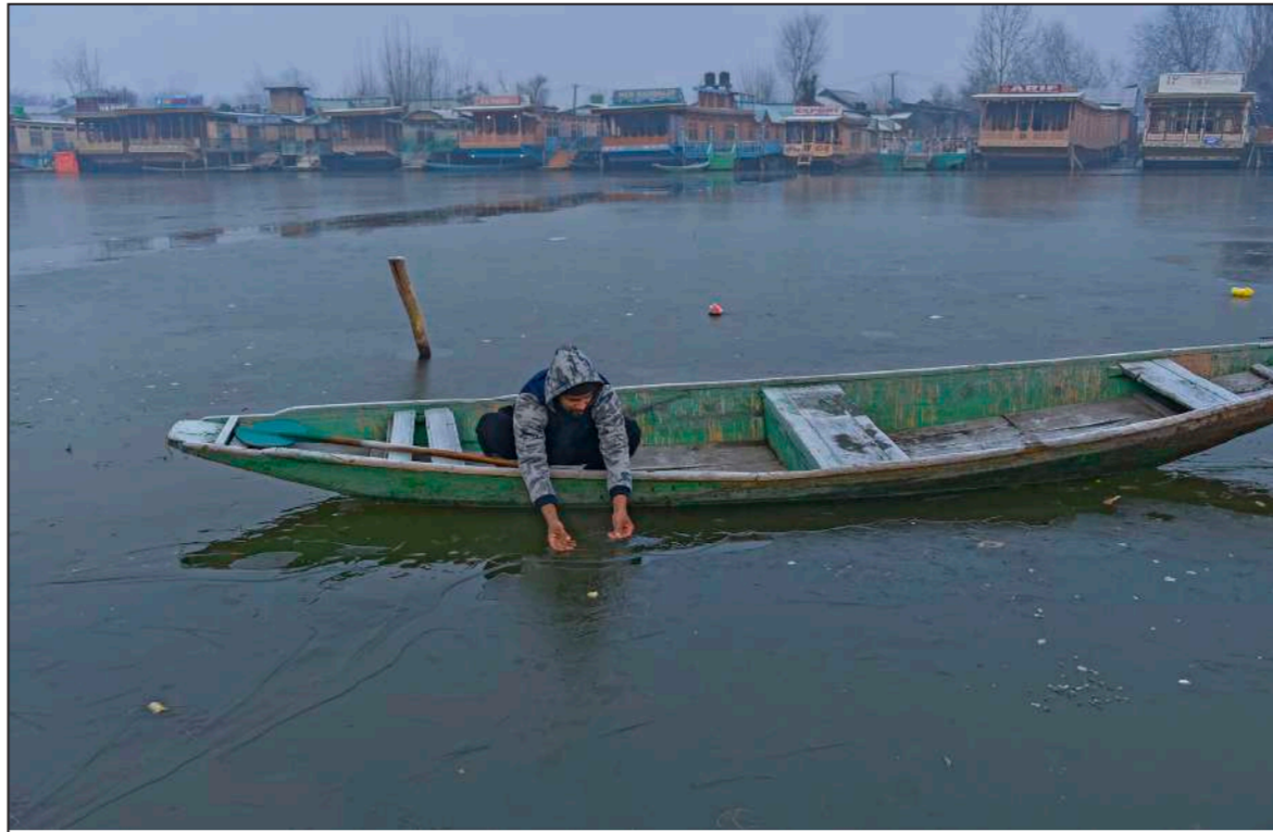
A boatman smashes a thin coating of ice (Tul Katur) that had developed on the crystal-clear water of the majestic Dal Lake in Srinagar amid sub-zero temperature on Wednesday.