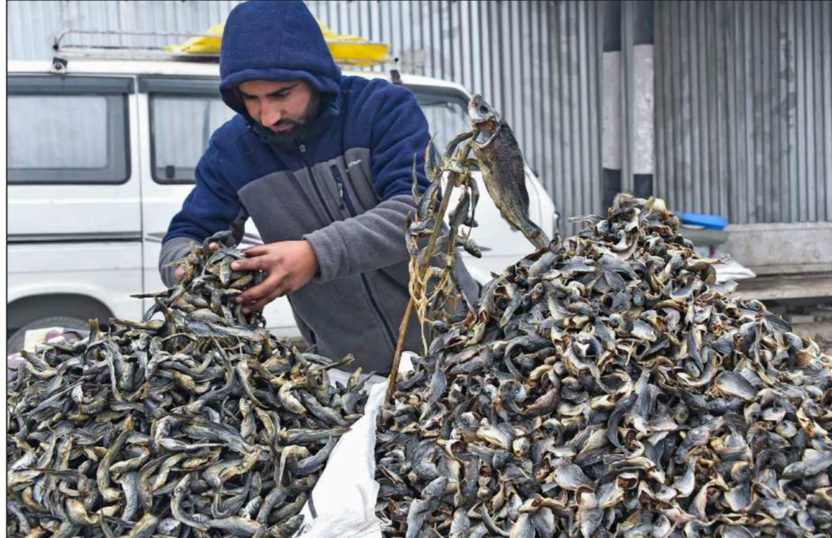
Demand for dried fish popularly known as hokh gaad in Kashmir, has surged as minimum temperature hover around below freezing point amid prolonged dry spell in Kashmir.

The locals on the occasion expressed gratitude to the Divisional Administration for addressing their long pending demand of putting an end to traffic gridlocks at Natipora by the development of parallel Bund Road.