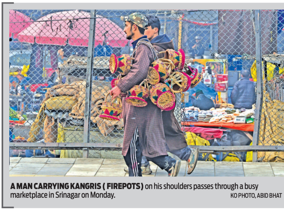
A MAN CARRYING KANGRIS ( FIREPOTS) on his shoulders passes through a busy marketplace in Srinagar on Monday.