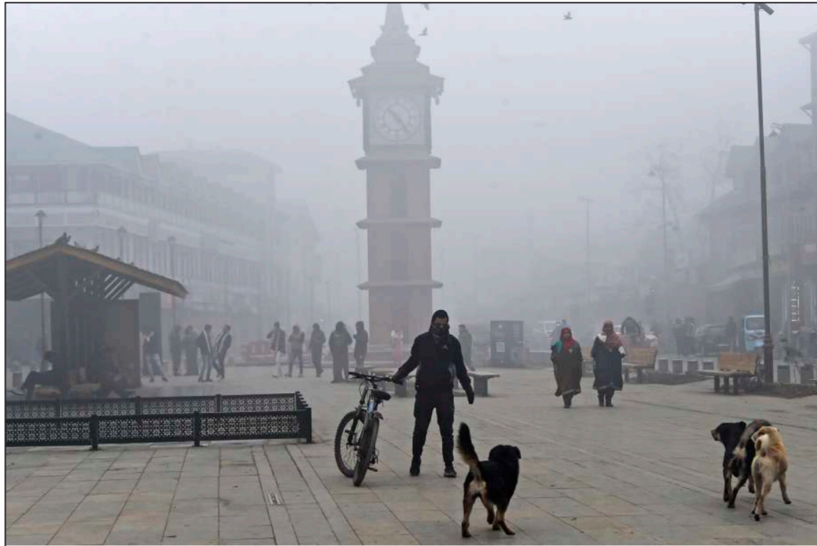
A guy protecting himself from a pack of stray canines, greeting him in the freezing cold on Monday, the first day of the new year, at the renovated Lal Chowk Square.

At Institute of Mental Health and Neurosciences (IMHANS) Government Psychiatric Diseases Hospital, Kathi Darwaza, the DC inspected the recently completed infrastructure development and upgradation works on Skill Development & Rehabilitation Centre for Youth affected j society.