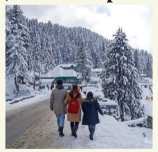
The department of tourism had invited a number of singers including Aabha | More on P06

The anticipated white blanket that tourists were eager to witness remained elusive, leaving them disappointed.