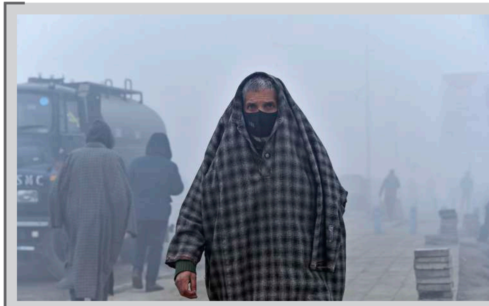
A MAN WITH HIS FACE AND HEAD COVERED, walks through Batamalo market of Srinagar city on a cold and foggy Friday morning.

The Army has ordered a comprehensive internal investigation, pledging full support and cooperation in the inquiry.