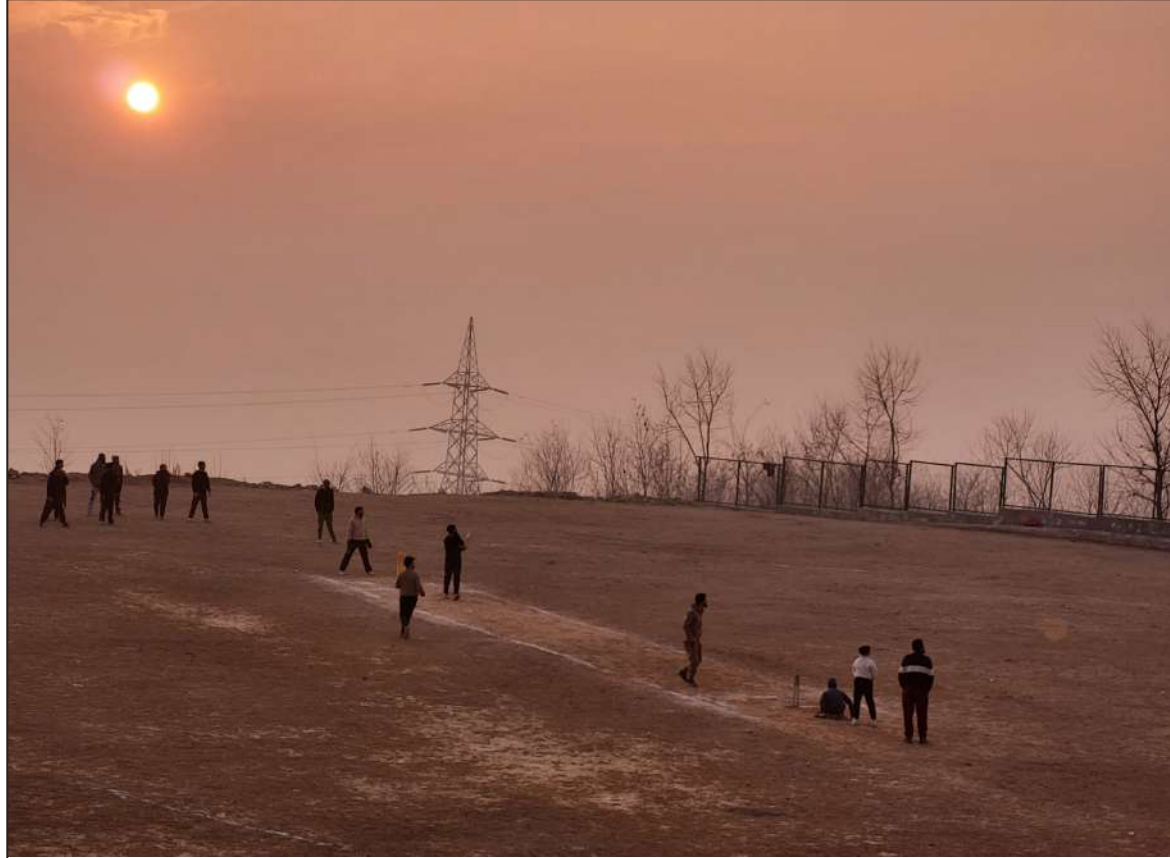
Boys play enthusiastically at the Khimber playground on the outskirts of the city, amid the crisp embrace of winter and a stunning sunset, bringing the spirit of cricket alive.

Director Agriculture underlined the importance of organizing more such programs in the coming days so that more and more educated young farmers could be attracted towards small-scale agri-cottage industries like apiculture, mushroom cultivation etc.