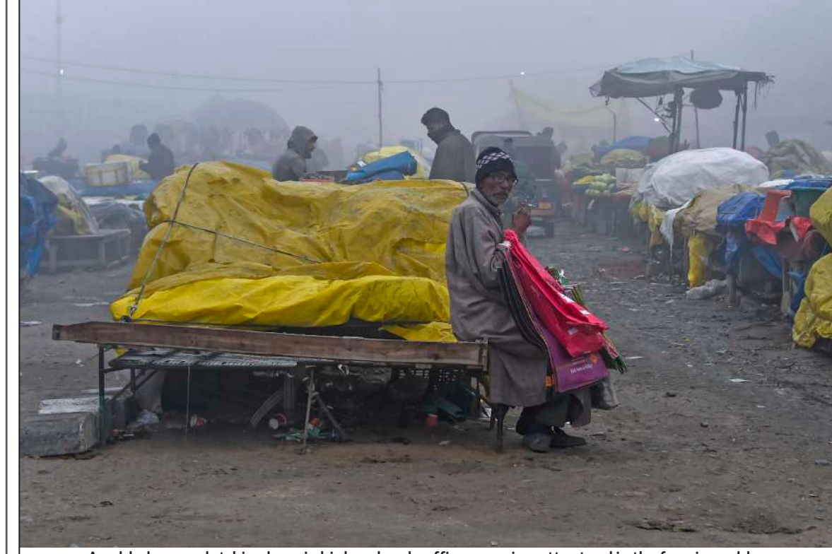
An elderly man clutching bags in his hand and puffing on a cigaratte stood in the freezing cold on Thursday morning, waiting for clients at the crowded Batamaloo market.

Invitation of Open Tender through E-Procurement system Assist, Material Manager, N. Railway, ETD/Store Depot/Ludhiana for and or